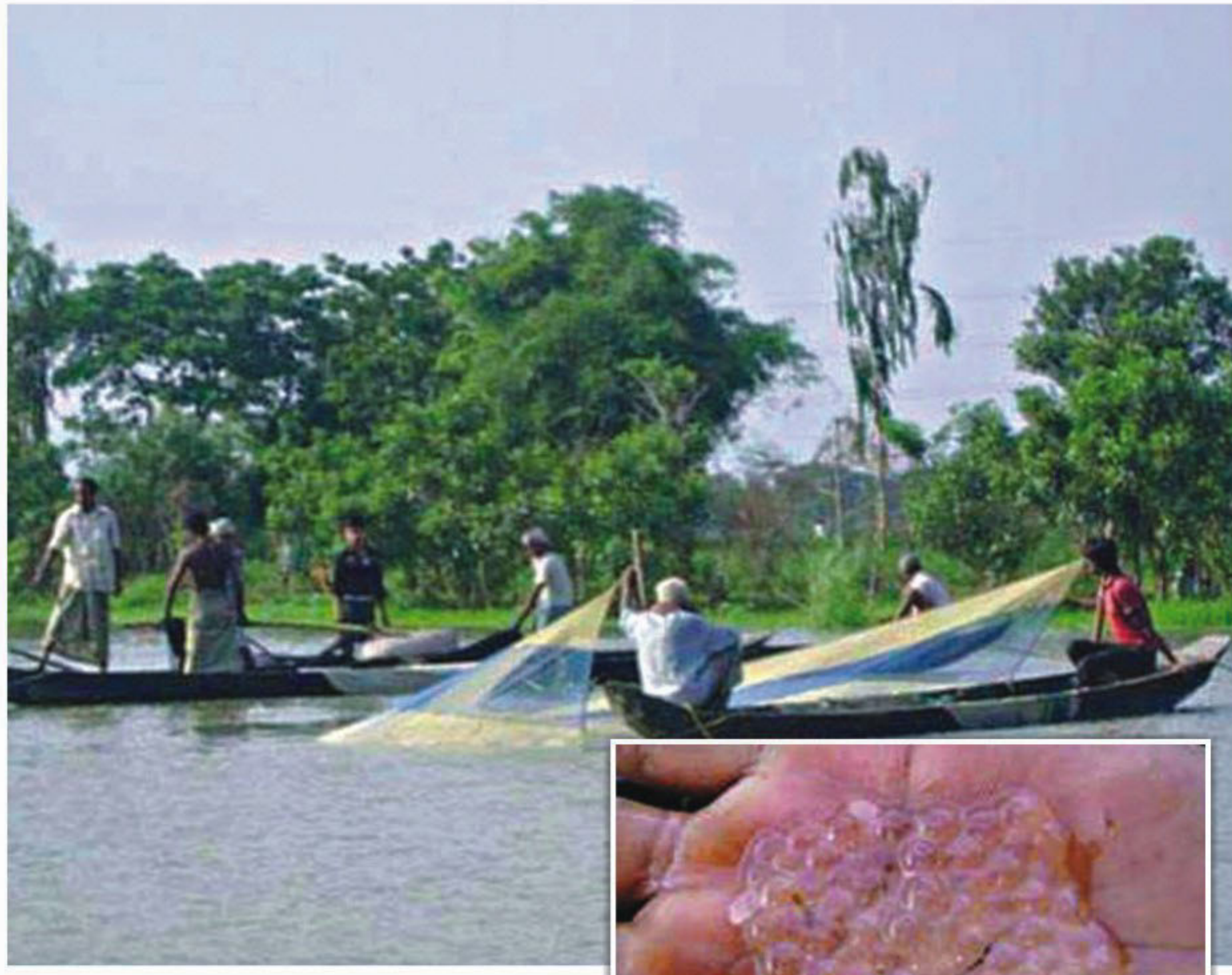
Fishermen collect eggs of fish from the Halda river well ahead of the season. Inset, a palm full of eggs collected from the river.