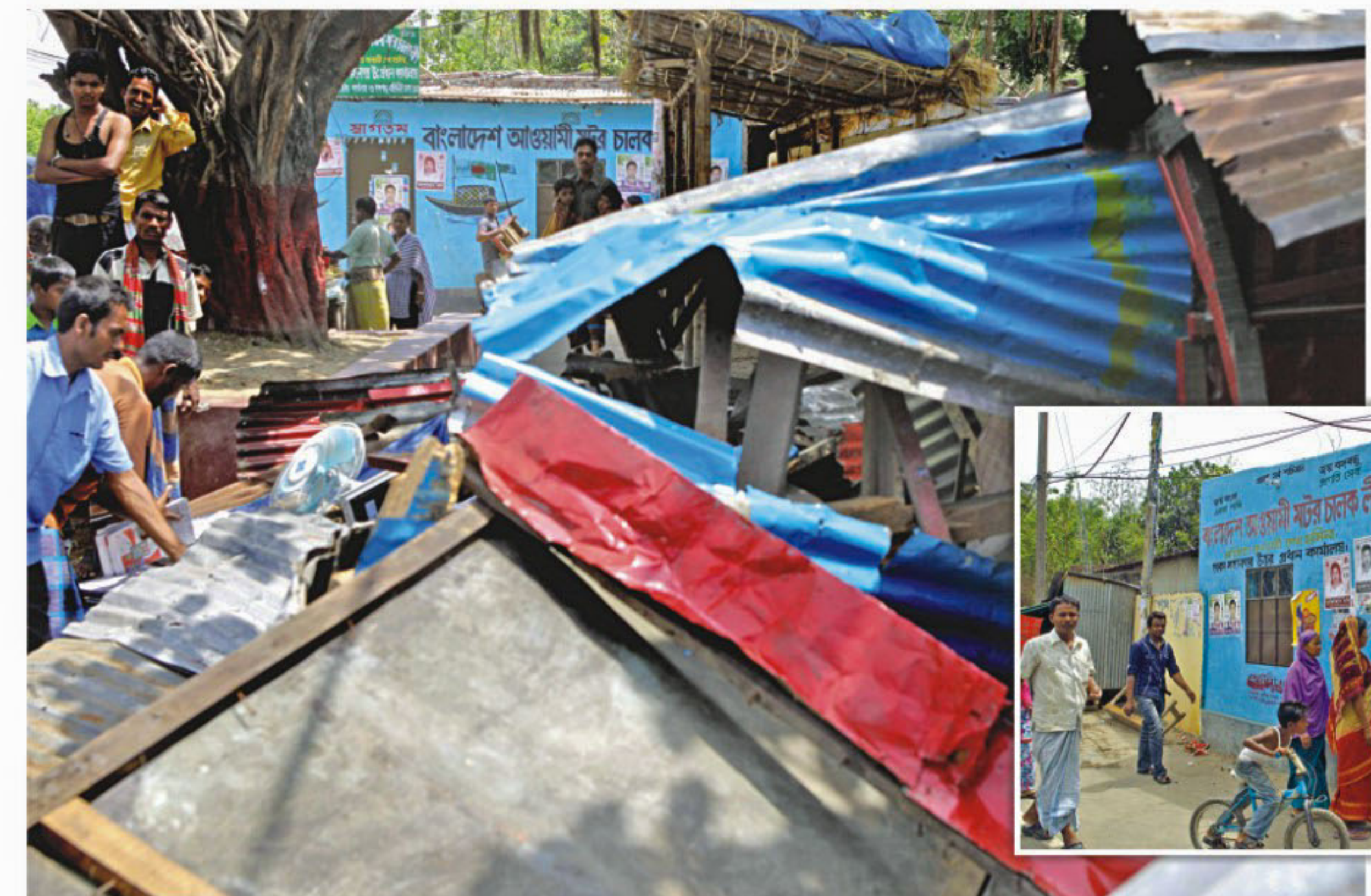
Dhaka City Corporation demolishes structures built illegally next to roads in Taltala of Agargaon in the capital. It, however, left the office of a ruling party associate organisation untouched.