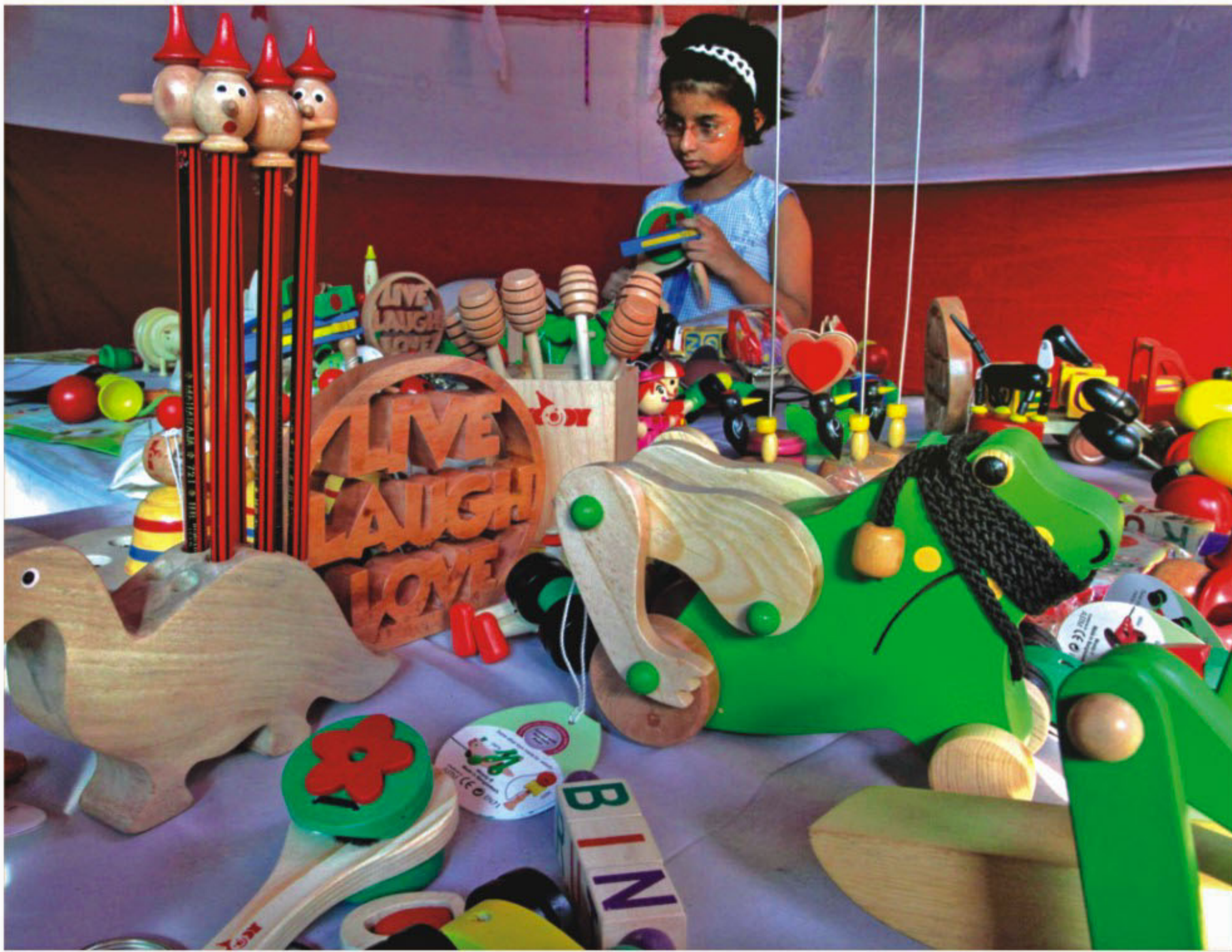
A child admires products on sale yesterday at a ten-day "Baishakhi Fair", that began on Bangla Academy premises in the city on April 14, organised by Bangladesh Small and Cottage Industries Corporation and the academy.