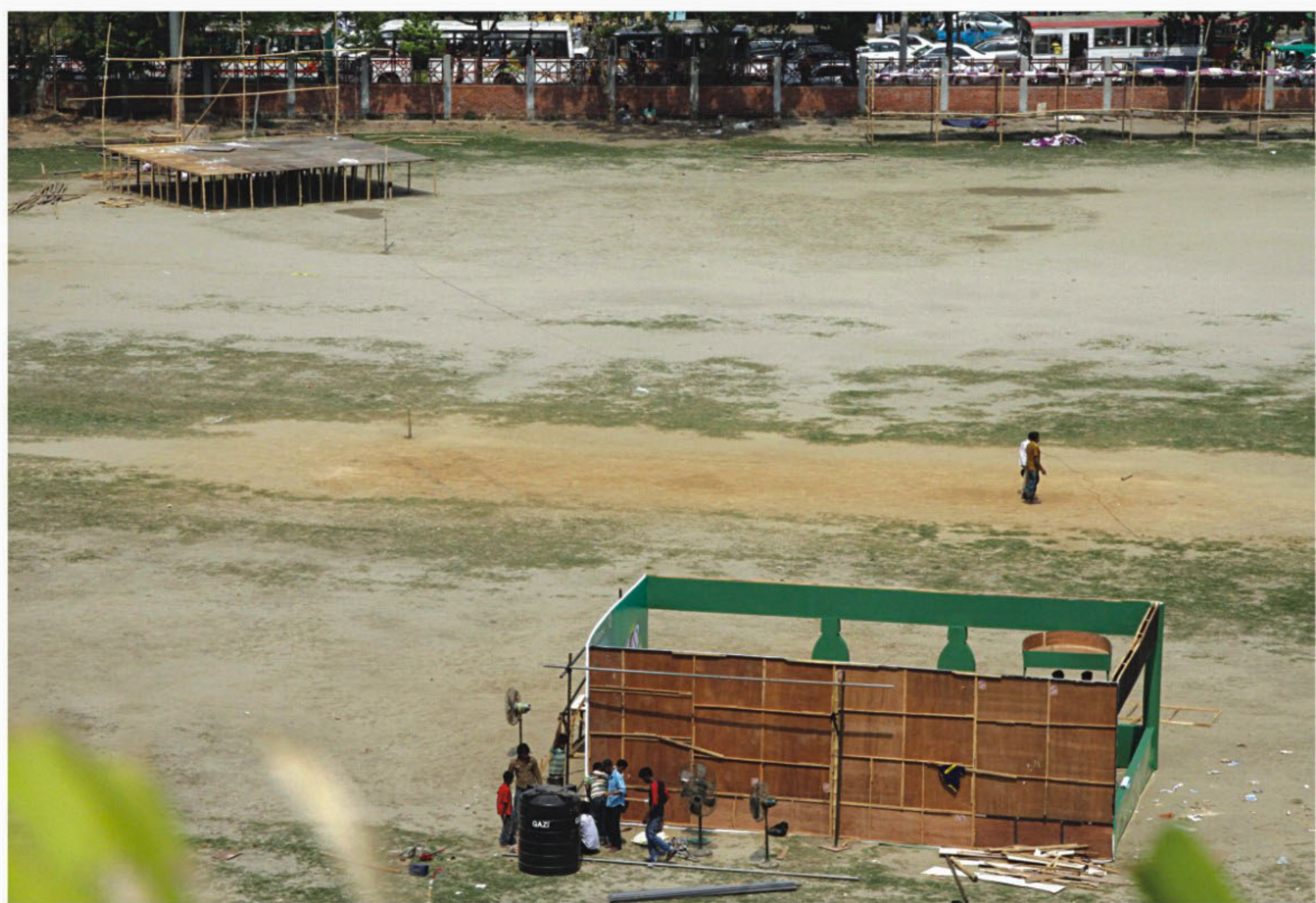
This photo taken on April 13 shows structures being built on Dhanmondi playground on Road-8 violating a court order that instructed everything not related to sports or park be removed.