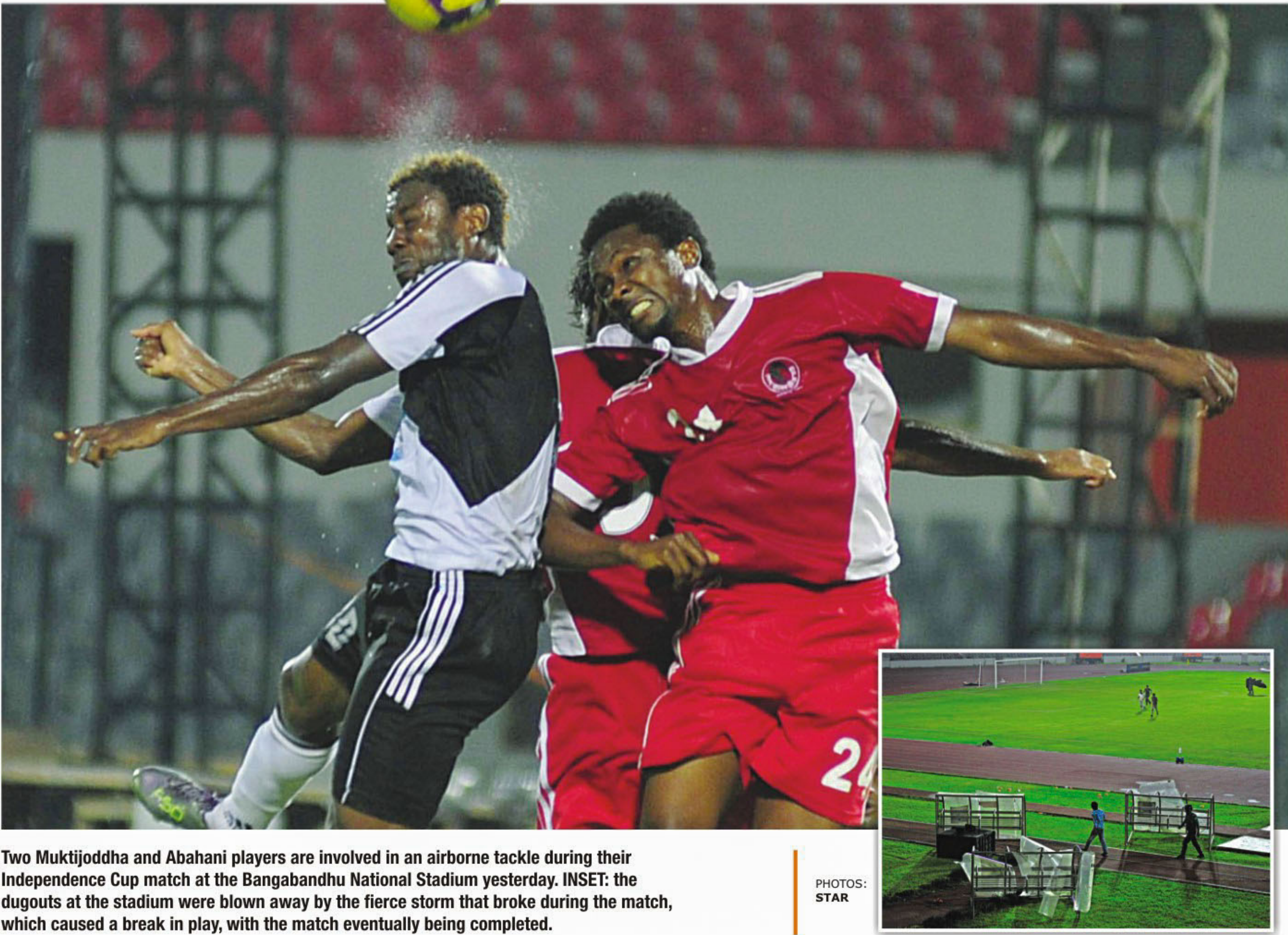
Two Muktioddha and Abahani players are involved in an airborne tackle during their Independence Cup match at the Bangabandhu National Stadium yesterday. INSET: the dugouts at the stadium were blown away by the fierce storm that broke during the match, which caused a break in play, with the match eventually being completed.