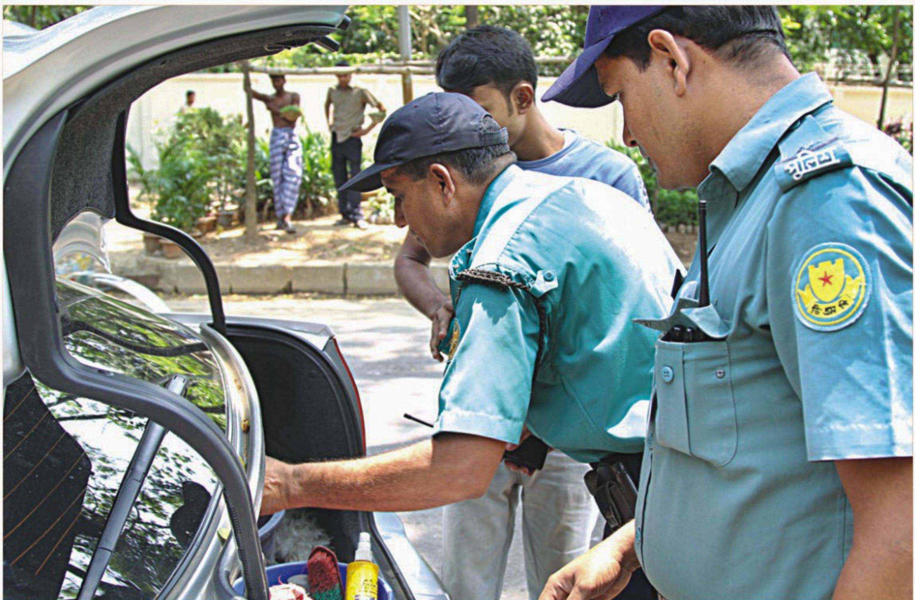
Police search a vehicle at a check post set up at Paribagh in the city yesterday. Dhaka Metropolitan Police stepped up vigilance with the rise in mugging in the city recently.

No dearth of law for punishing the culprits and corrupts. What is lacking is the will of the government