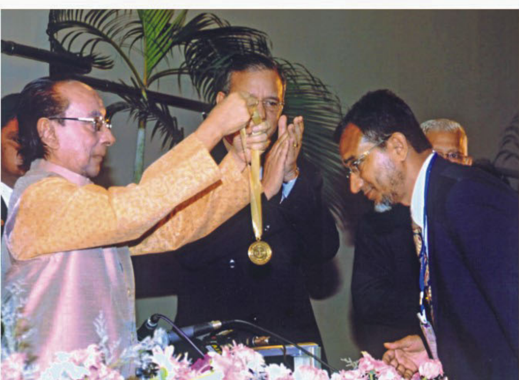
President Zillur Rahman distributes gold medals to one of the seven non-Rotarians for their outstanding contribution to various social welfare arenas. The ceremony was organised by "Rotary International District 3280" at a city hotel yesterday.