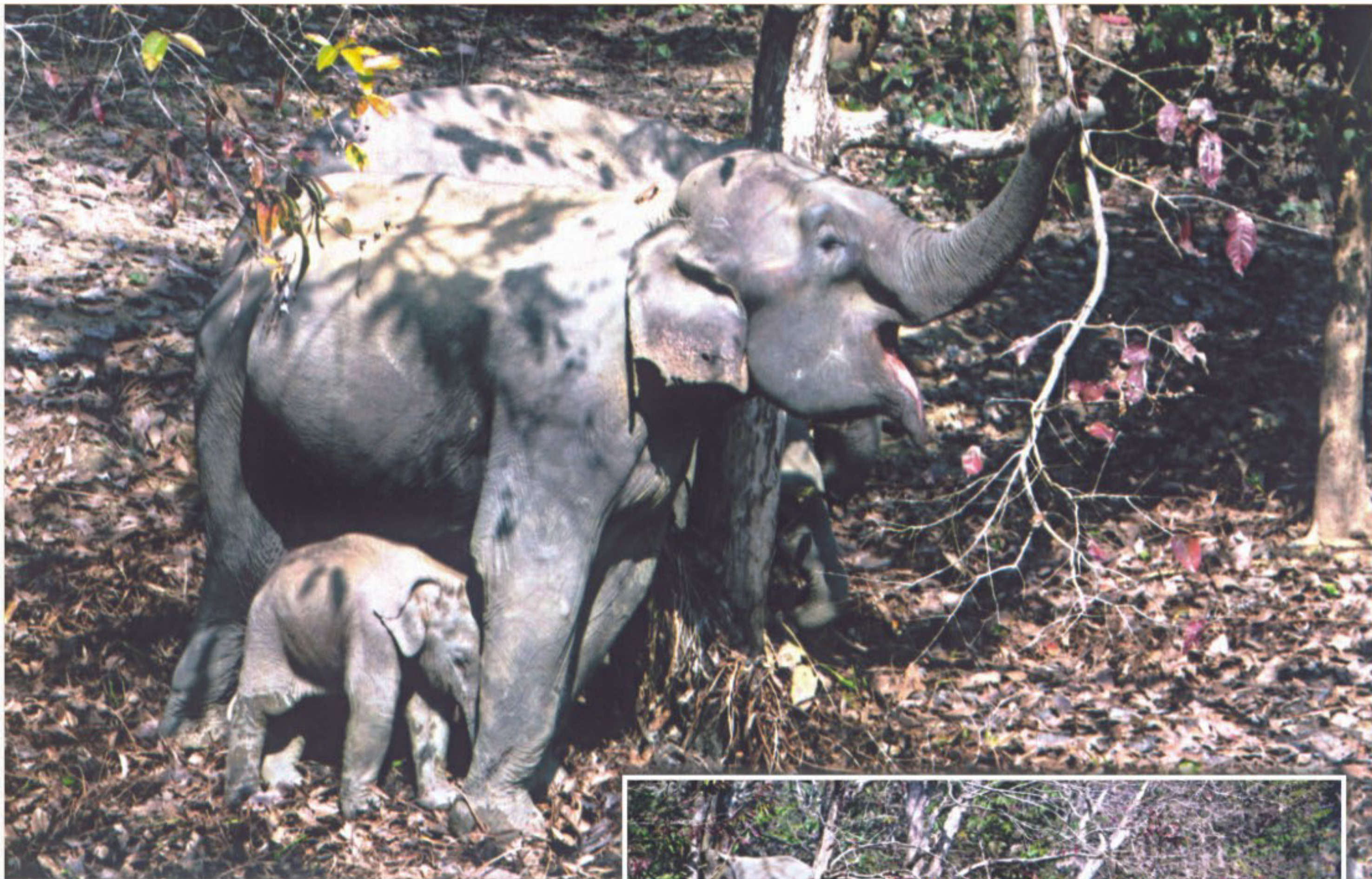
An elephant, with a young one, trying to eat the leaves of a tree at the Pablakhali Wildlife Sanctuary in Rangamati. Elephant food in this sanctuary has largely been wiped out by new settlers. Inset, locals irritating a migrating herd of elephants.