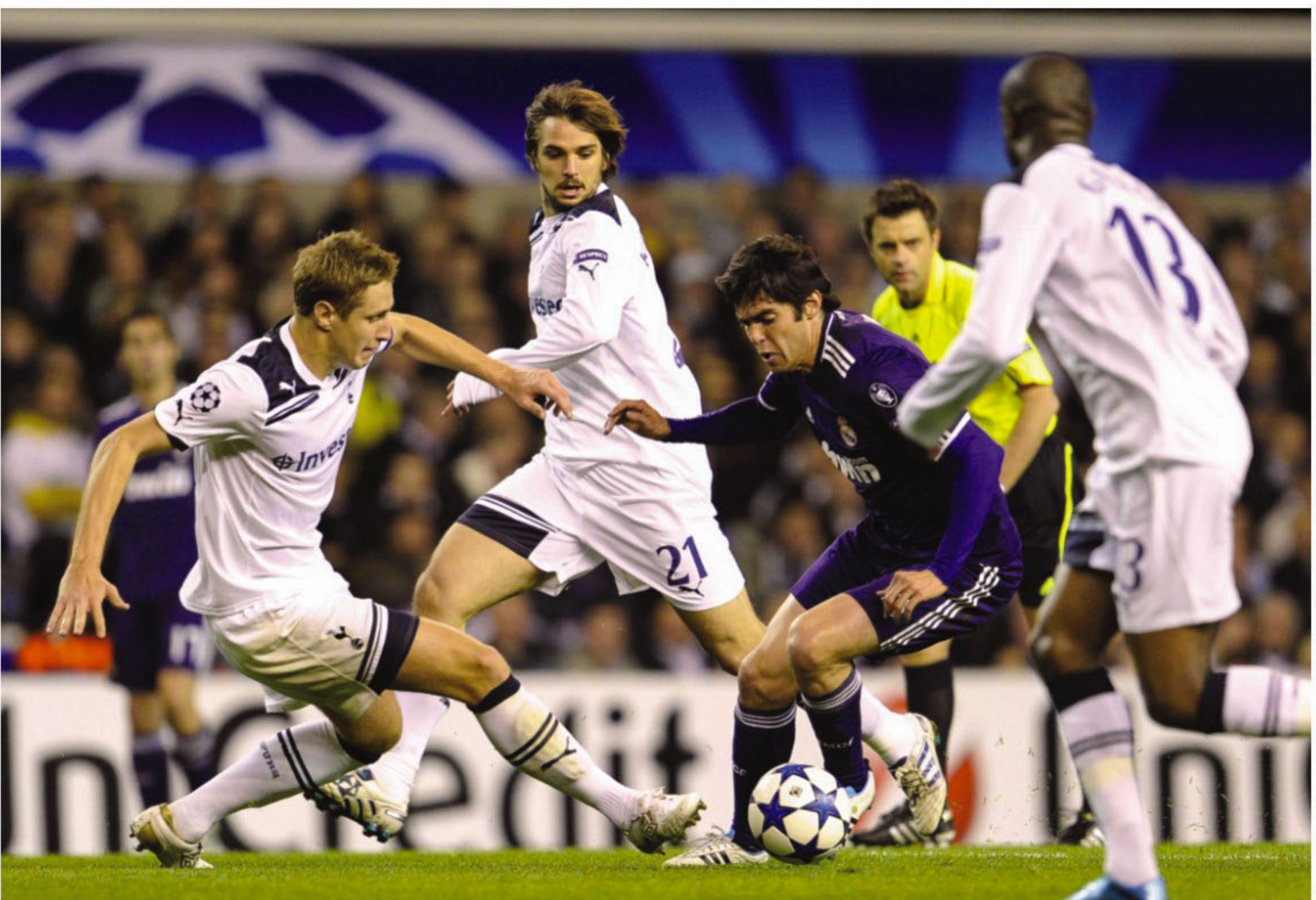
Real Madrid playmaker Kaka (C) wriggles past the challenge of Tottenham Hotspur defender Michael Dawson (L) during their Champions League quarterfinal at White Hart Lane on Wednesday.