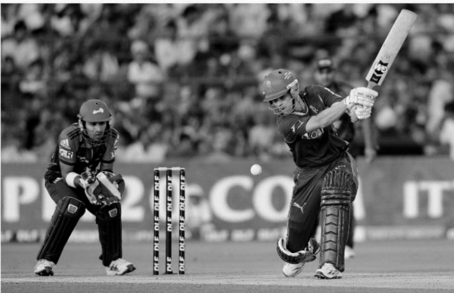
Rajasthan Royals batsman Johan Botha plays a square drive as Delhi Daredevils wicketkeeper Naman Ojha (L) looks on during their IPL match at the Sawai Man Singh Stadium in Jaipur yesterday.

Result: Rajasthan Royals won by six wickets.