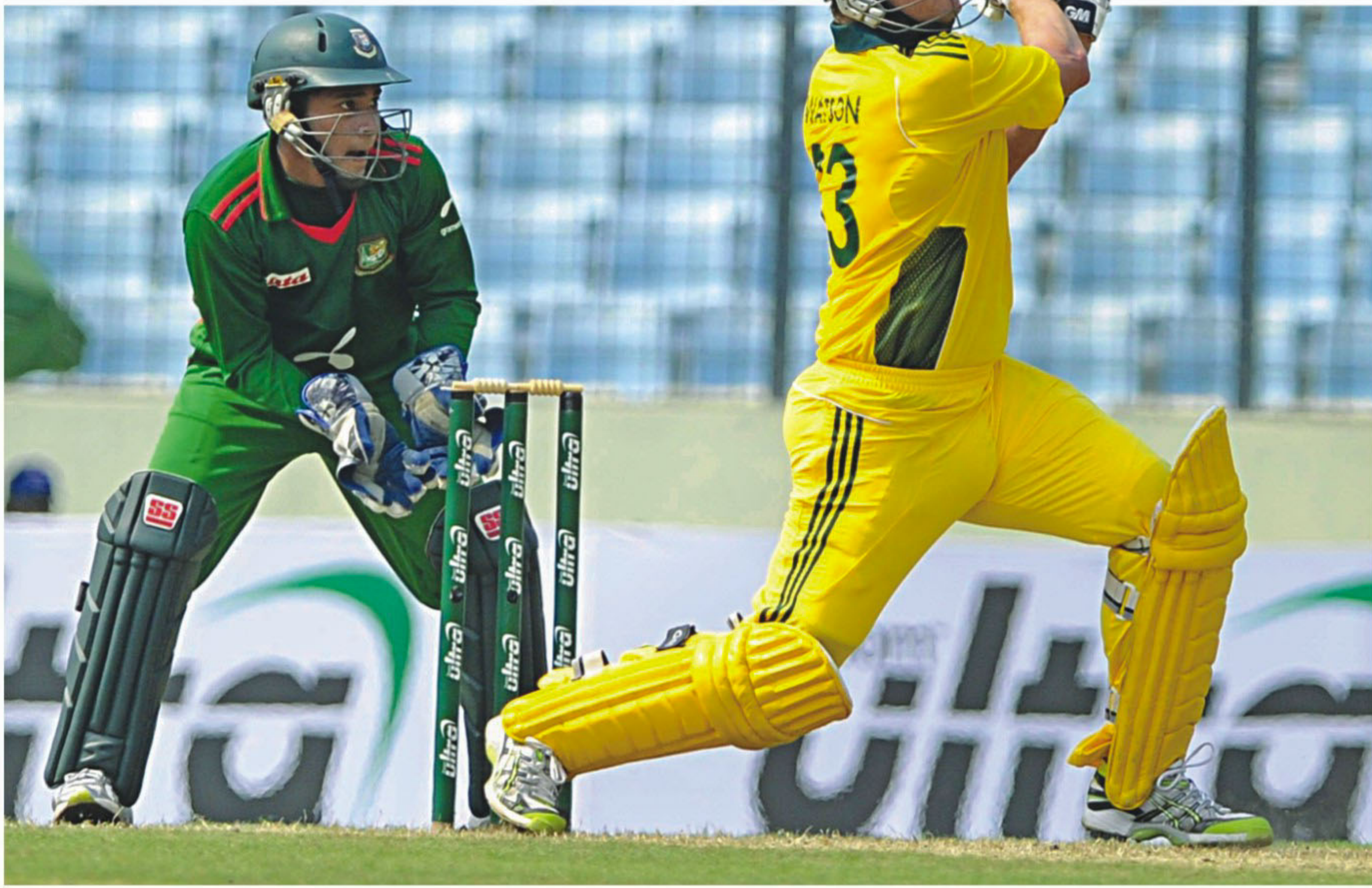
MEGA WATT0: Australia opener Shane Watson gets down on one knee to pull another one of his record-breaking fifteen sixes in the second ODI against Bangladesh at the Sher-e-Bangla National Stadium yesterday.