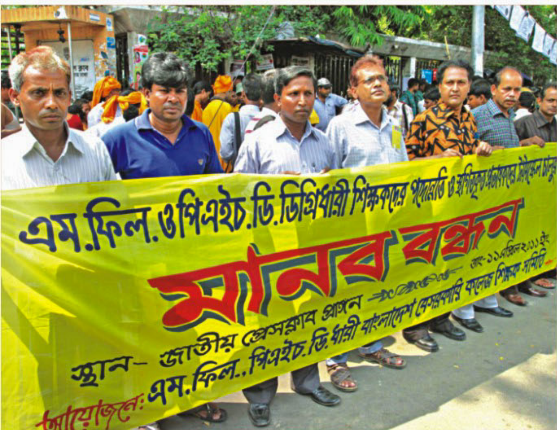
College teachers with MPhil and PhD degrees form a human chain in front of Jatiya Press Club in the city yesterday demanding their promotion and timescale.

Education. Job. Career... all... in Canada.