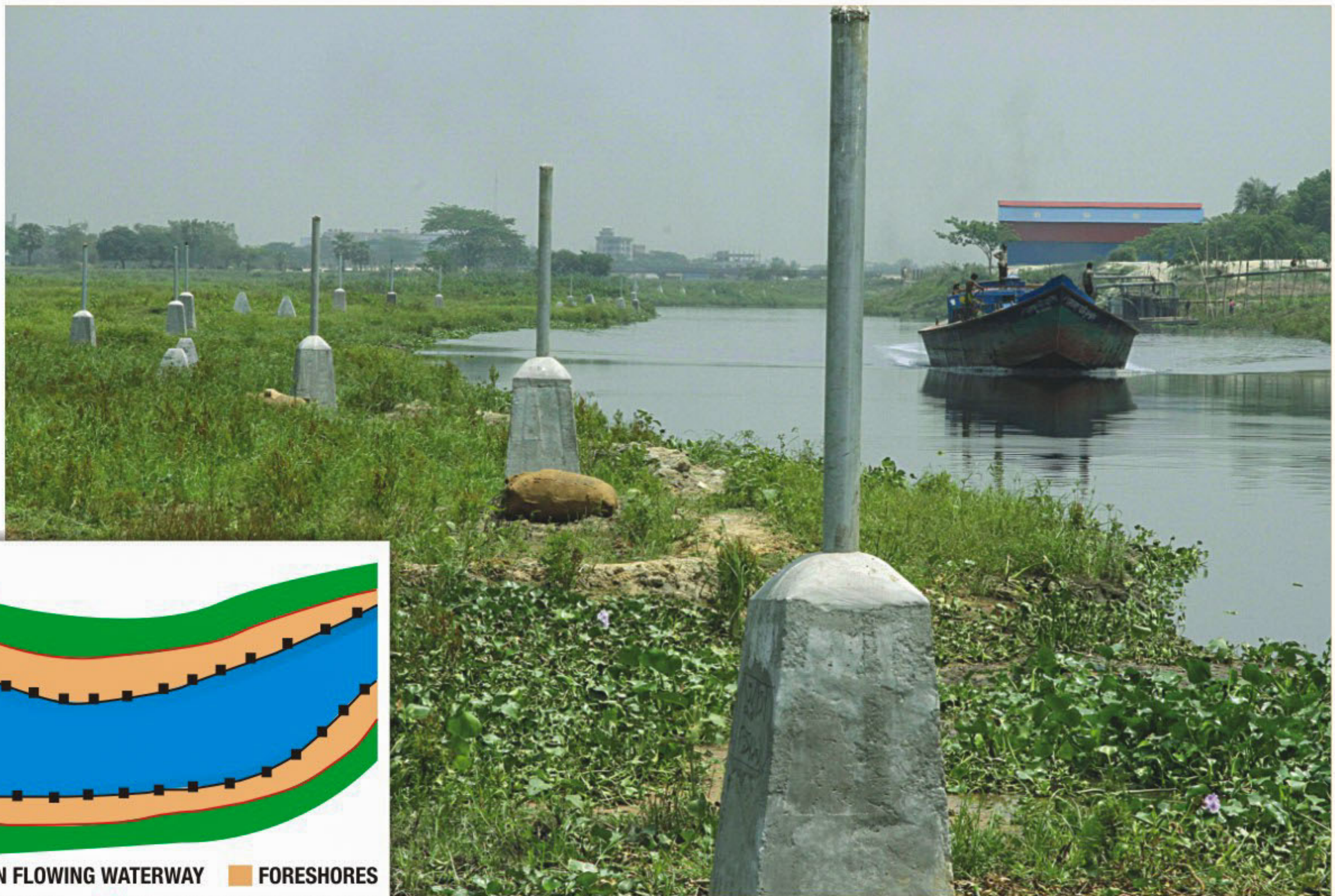
The Turag River is demarcated with pillars excluding the foreshore in violation of a High Court order.