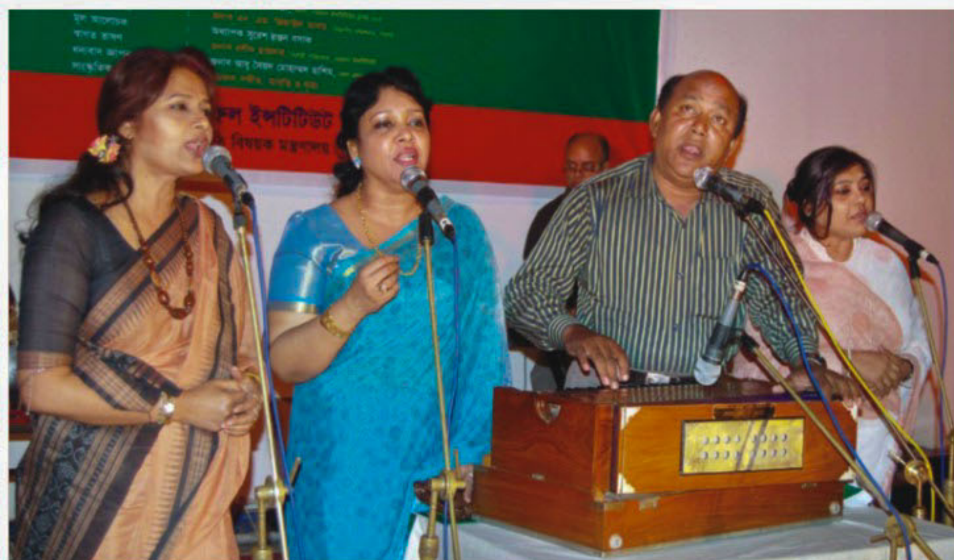
Noted Nazrul Sangeet artistes perform at the event.