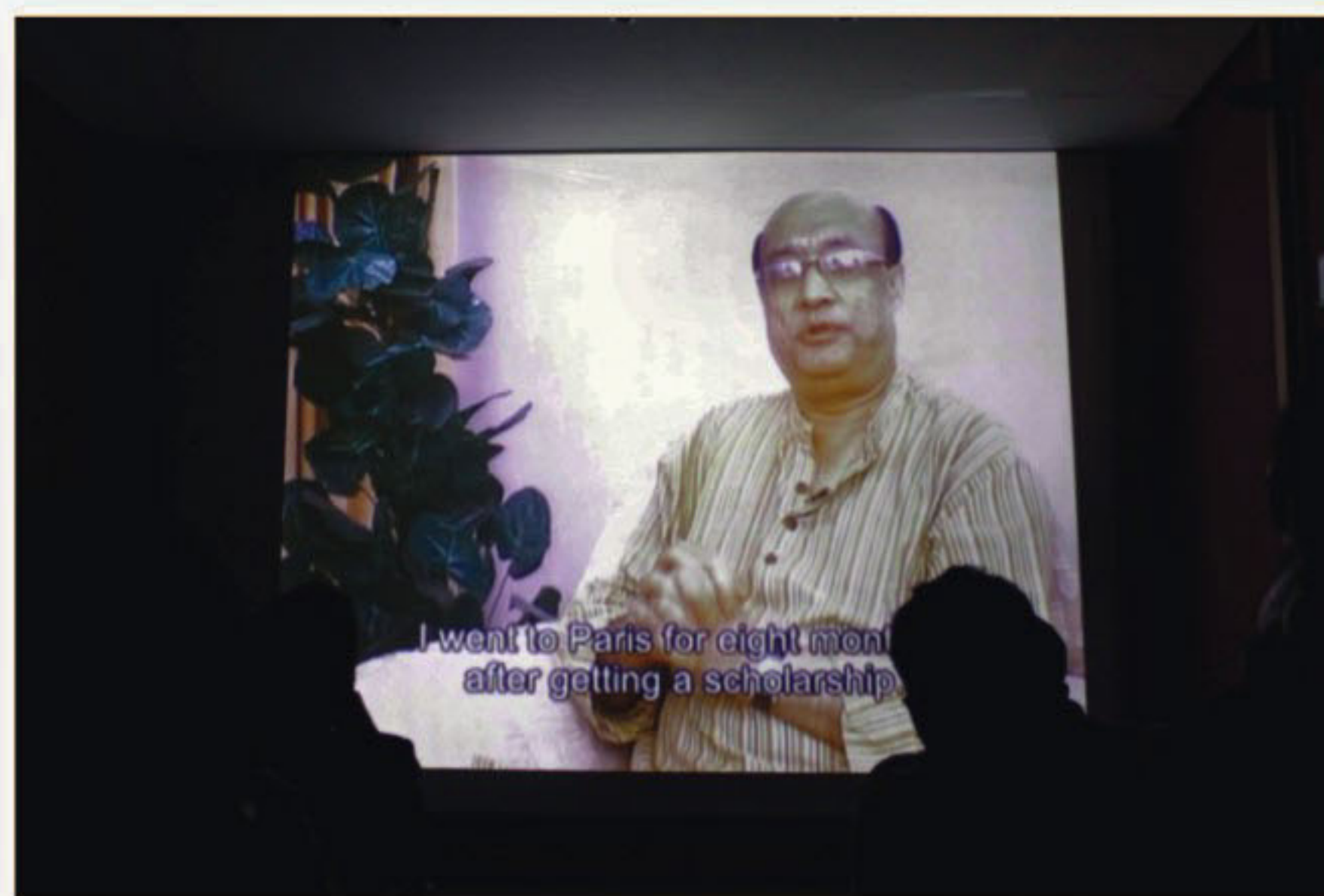
The documentary was screened at Alliance Française de Dhaka.