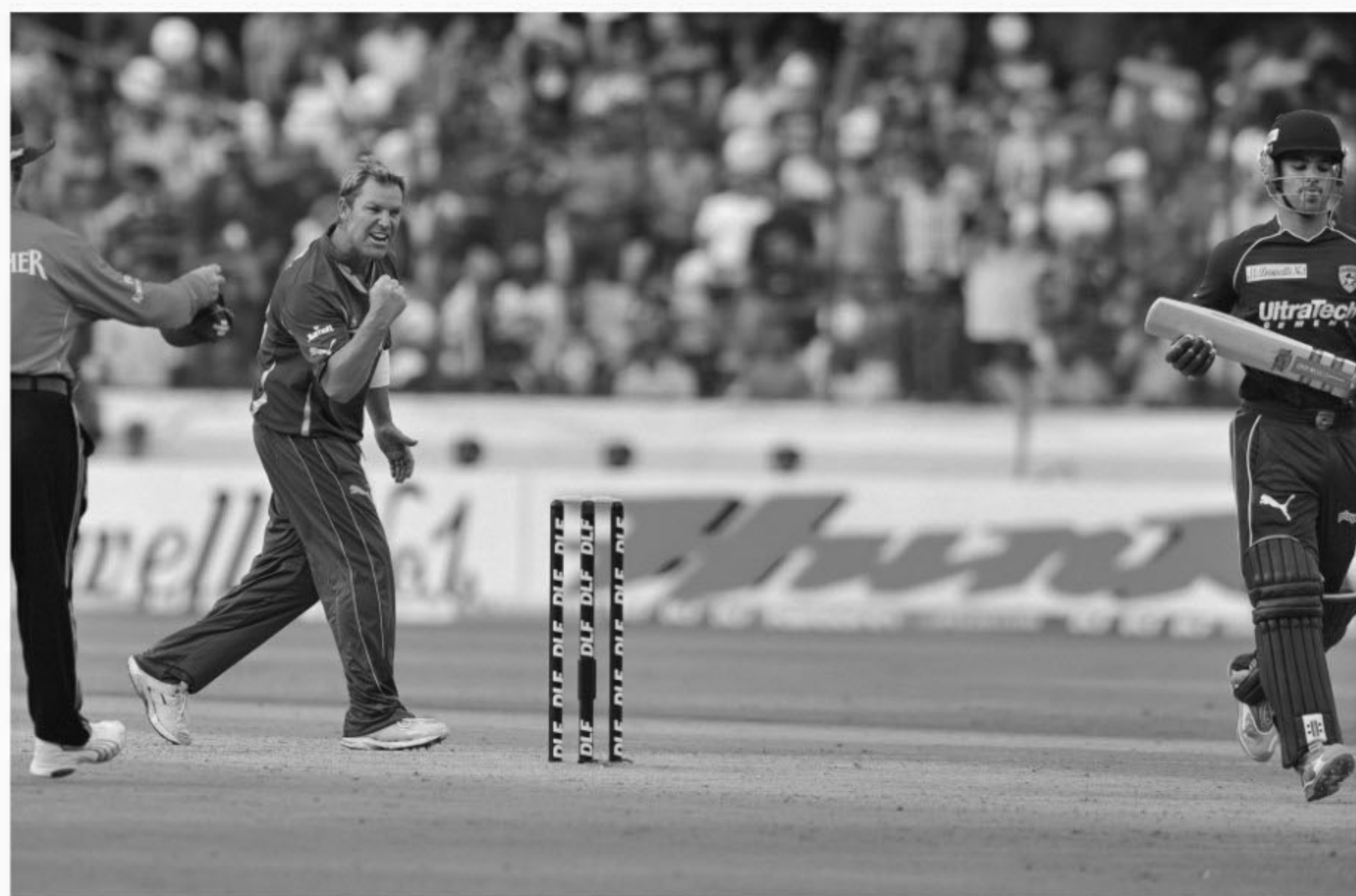
Rajasthan Royals skipper Shane Warne delivers a sendoff to JP Duminy after casting the Deccan Chargers left-hander during their IPL match at the Rajiv Gandhi International Stadium in Hyderabad yesterday.

The second and final four-day match will be held at the Maritzburg Oval in Pietermaritzburg from April 13.