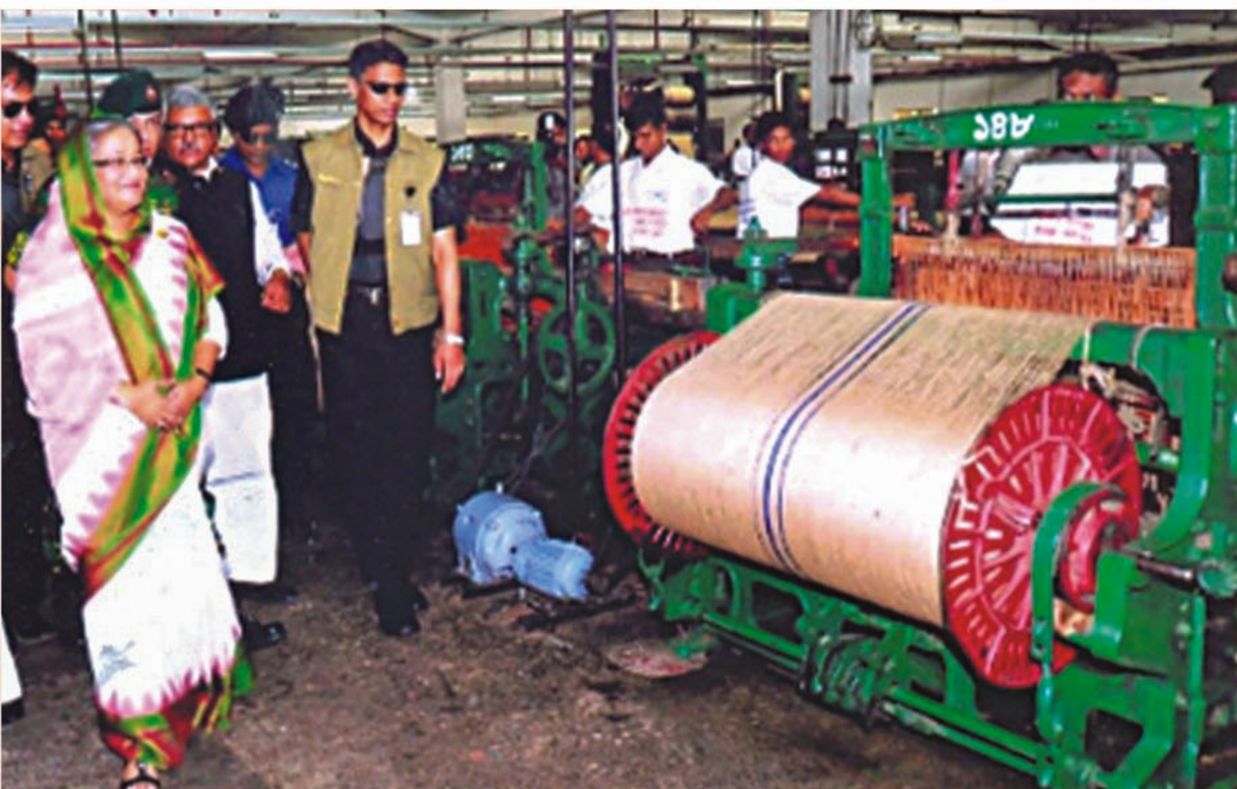
Prime Minister Sheikh Hasina visits Jatiya Jute Mills (former Qaumi Jute Mills) after inaugurating it in Sirajganj yesterday. (Story on Page B-1)