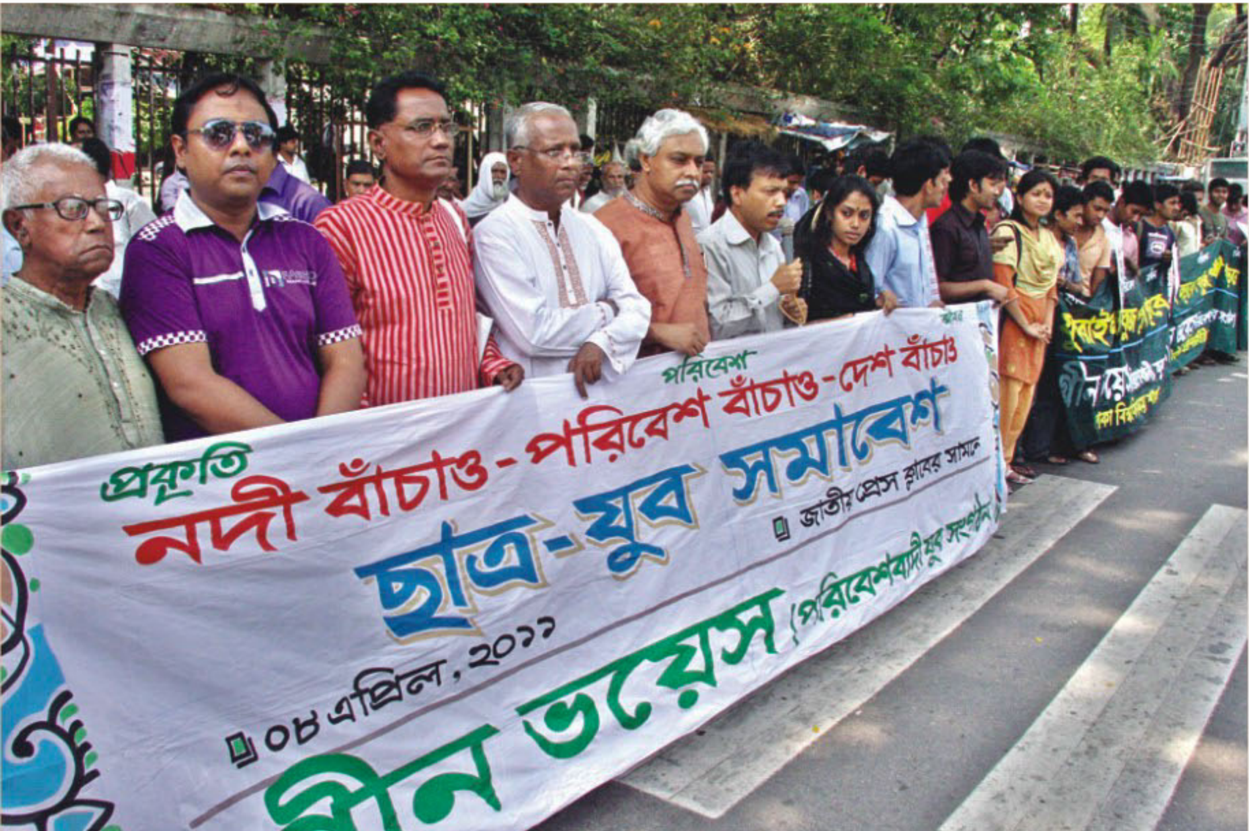
Green Voice, an environmental organisation, forms a human chain in front of the Jatiya Press Club in the city yesterday demanding a halt to pollution and grabbing of rivers in the country.

Finance Minister AMA Muhith on Thursday declined to disclose the names that appeared in the inquiry committee report, saying that they are influential people and needs further inquiry.