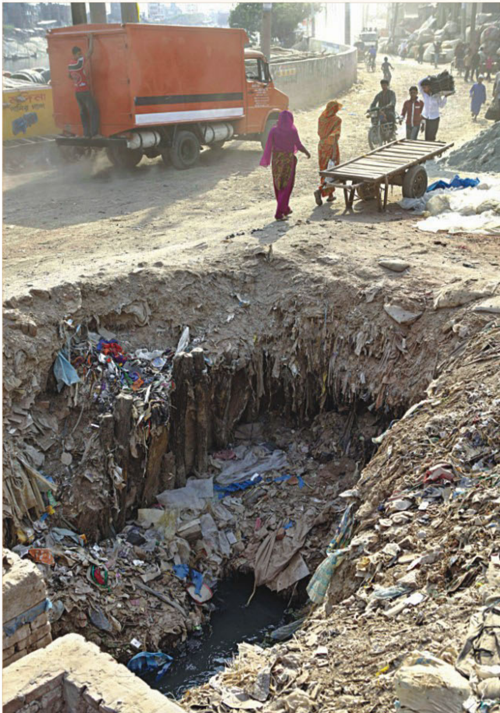
This gaping hole on Beribadh Road, which is in a sorry state from Abu Bazar to Aminbazar, at Islambagh in the city poses a hindrance to commuters and a threat to vehicles. The photo was taken yesterday.