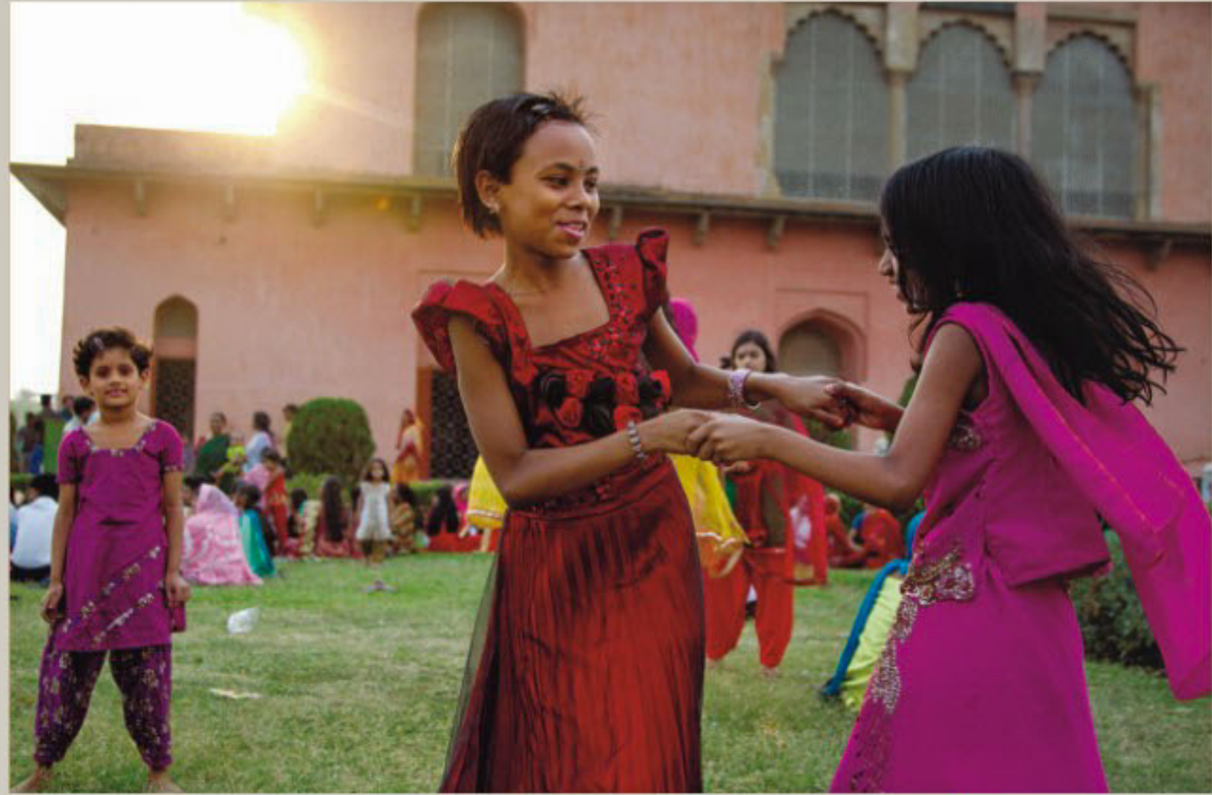
Fun at the Kella.