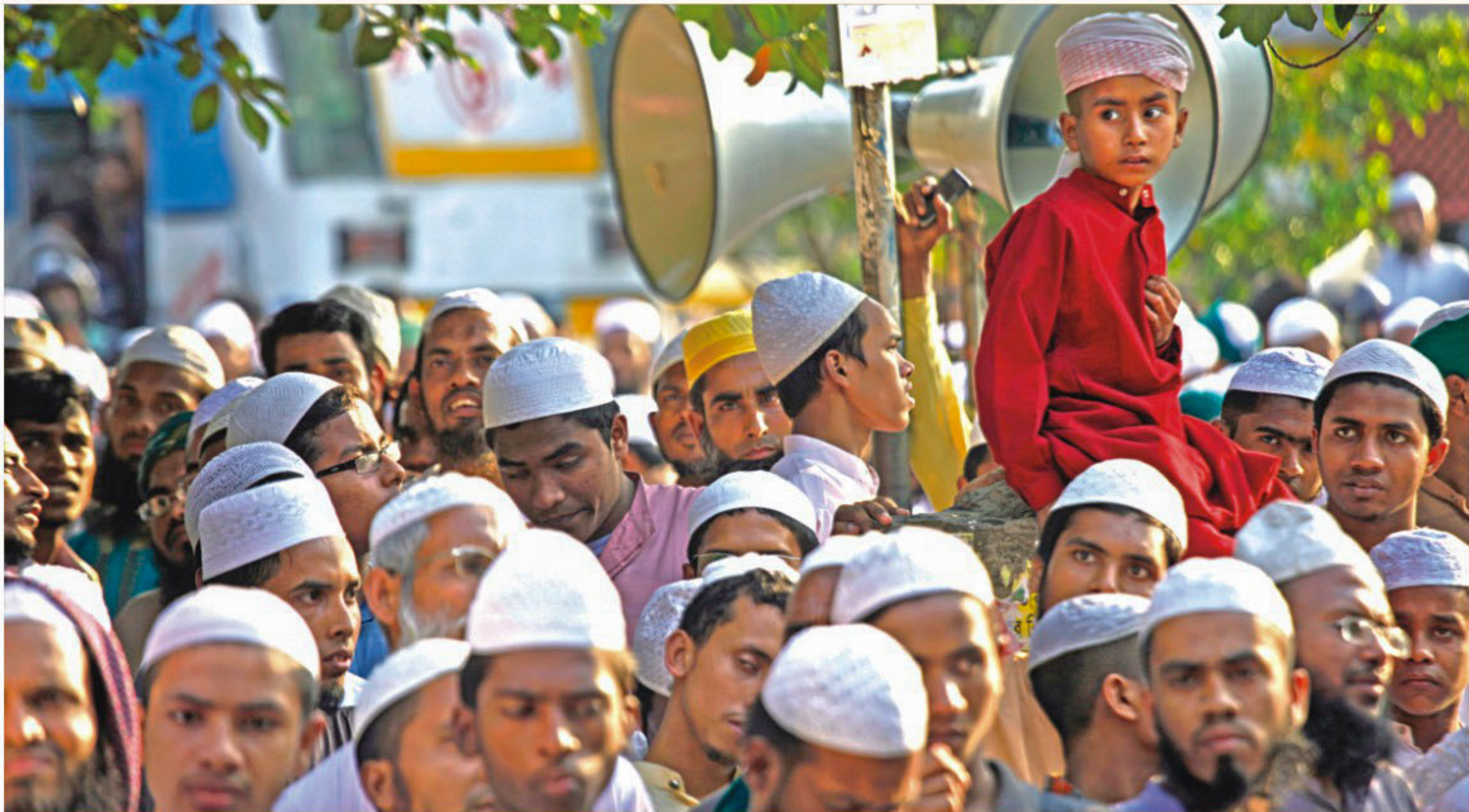
Children are seen at a rally organised by Islami Andolan Bangladesh at Muktangan in the capital yesterday. Ironically, chief of the same organisation day before yesterday spoke against the use of children during hartals and demonstrations.