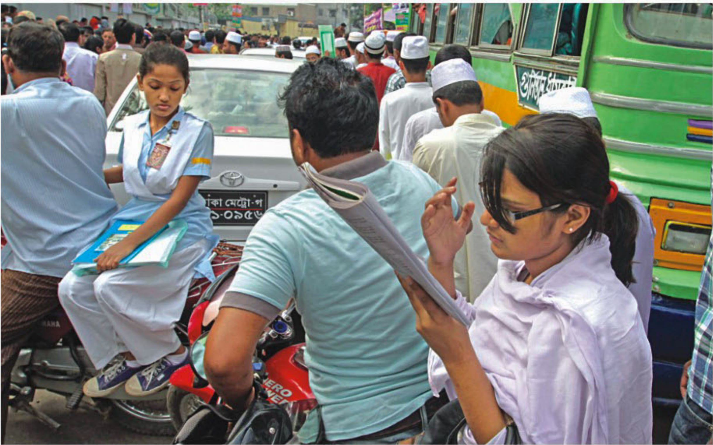
An HSC examinee caught in a traffic jam at Bakshibazar carries out her last minute revision on way to Begum Badrunnesa Govt Girls' College yesterday morning. On the first day of the exams, the city saw a huge congestion mostly to the suffering of examinees and guardians.