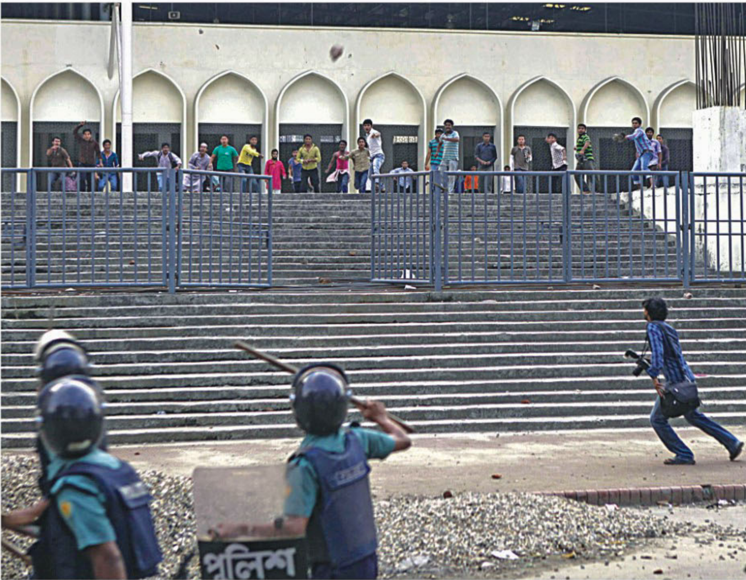
Jamaat-Shibir activists pelt police with brickbats from Baitul Mukarram mosque in the capital during a clash yesterday.