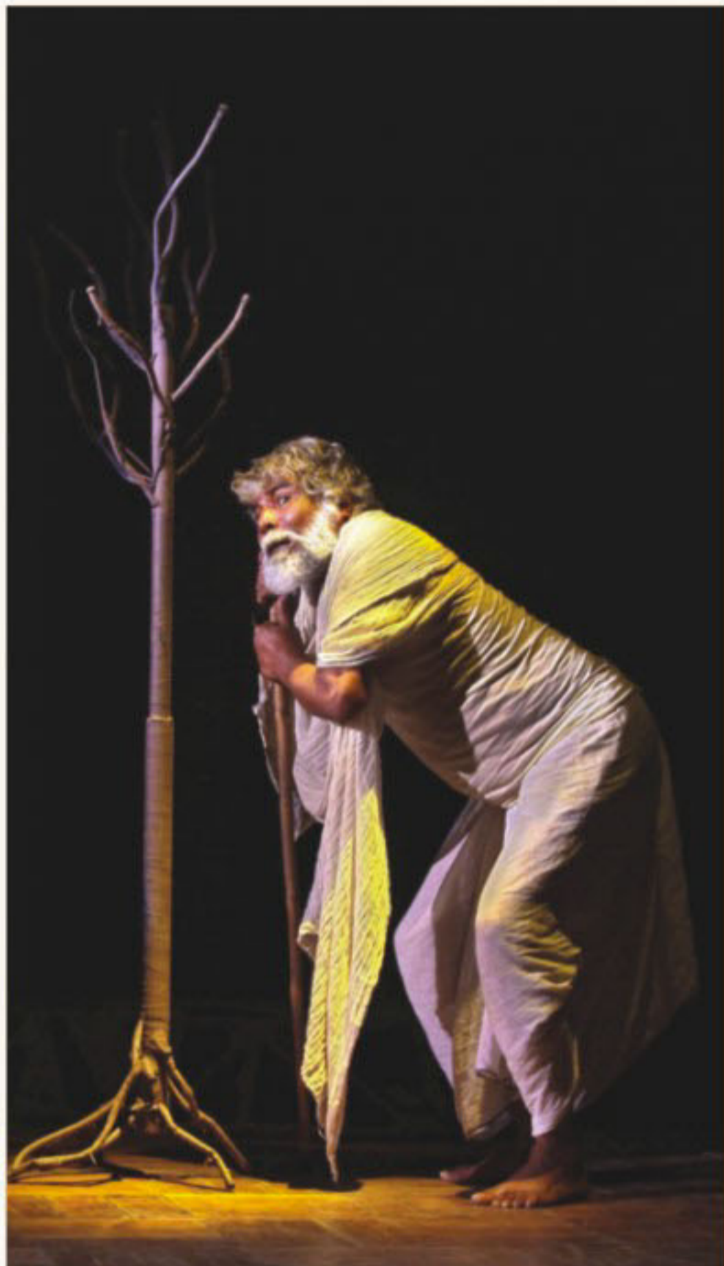
Scenes from "Joldash" (left) and "Majhrater Manushera". The plays will be stage at the festival.