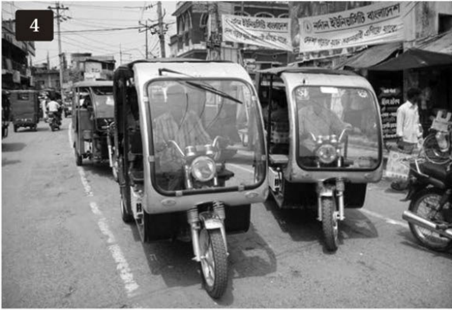
1) Activists of Islami Ain Bastabayan Sangstha, a body linked to a faction of Islami Oikya Jote led by Fazlul Huq Amine, read the holy Quran sitting on a road in Moulvibazar town, 2) block rail track at Brahmanbaria, 3) set a police van afire at Nagarkanda upazila headquarters in Faridpur, 4) battery-run auto-rickshaws plying the main road in Natore town during yesterday's hartal enforced by the organisation as part of its campaign against the government's newly announced national women policy.