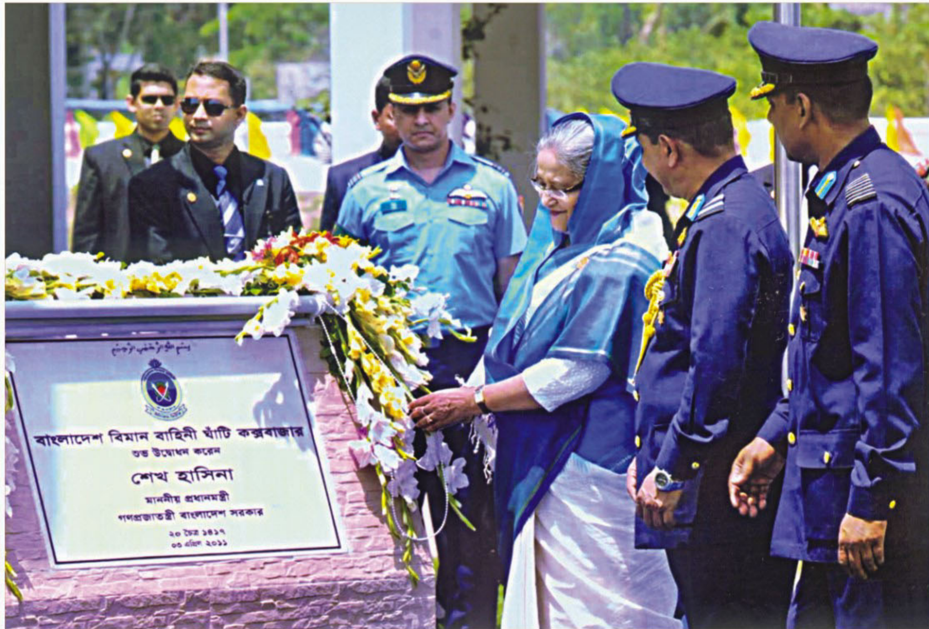
Prime Minister Sheikh Hasina inaugurates the new airbase of Bangladesh Air Force in Cox's Bazar yesterday.

CPB General Secretary Mujahidul Islam Selim and other leaders of the party yesterday visited him and prayed for his recovery.