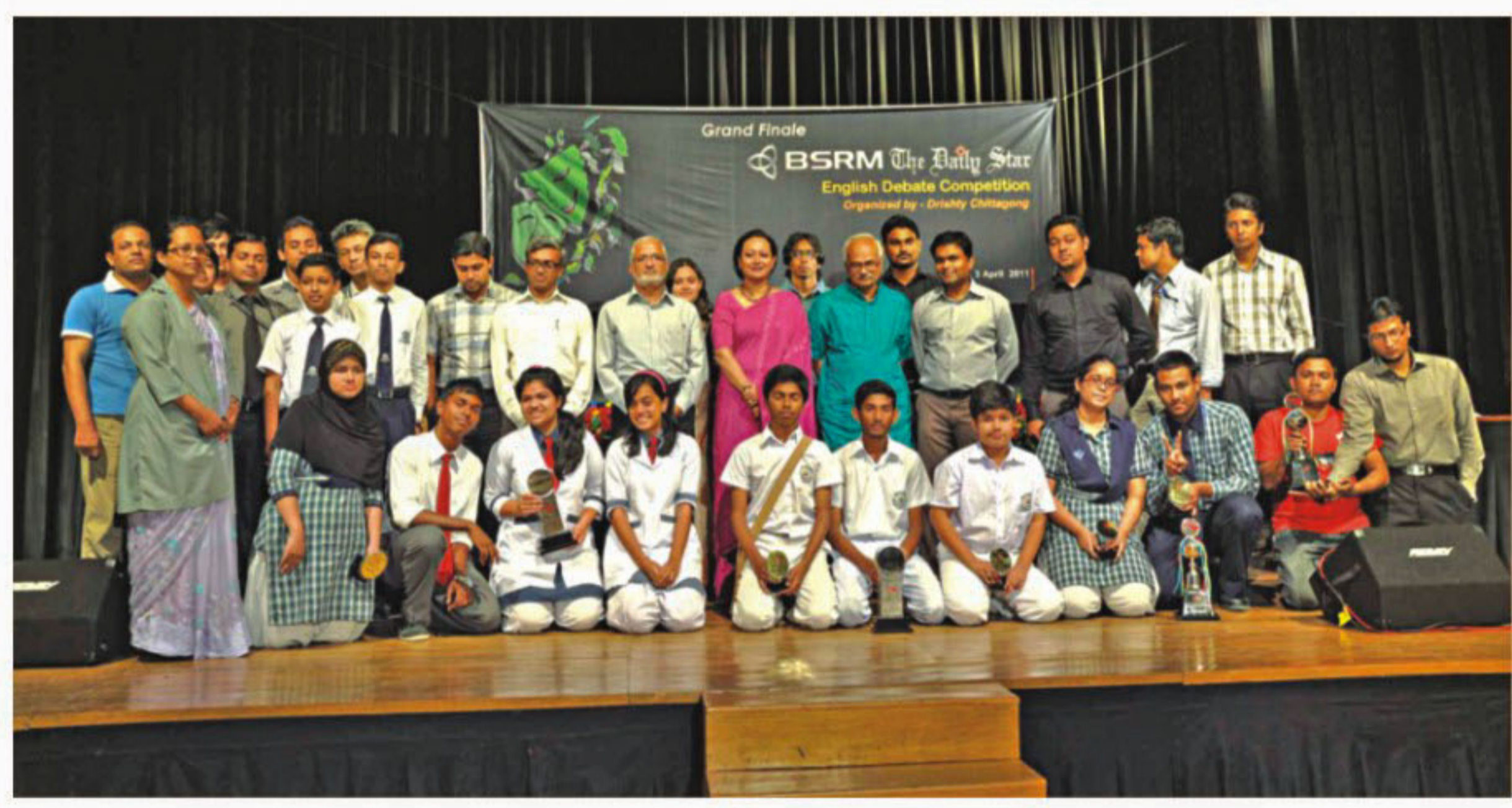
Guests pose for a photograph with the winners of The Daily Star-BSRM English debate competition organised by Dristy Chittagong at Theater Institute of Chittagong yesterday.

Bangladesh Awami League will hold a meeting. Venue: House no-51/A, Road