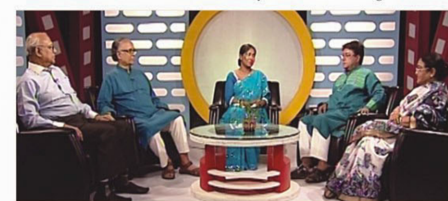
Theatre personalities on the talk show "Paad Prodig-er Aloy Ka'on Natyajon".