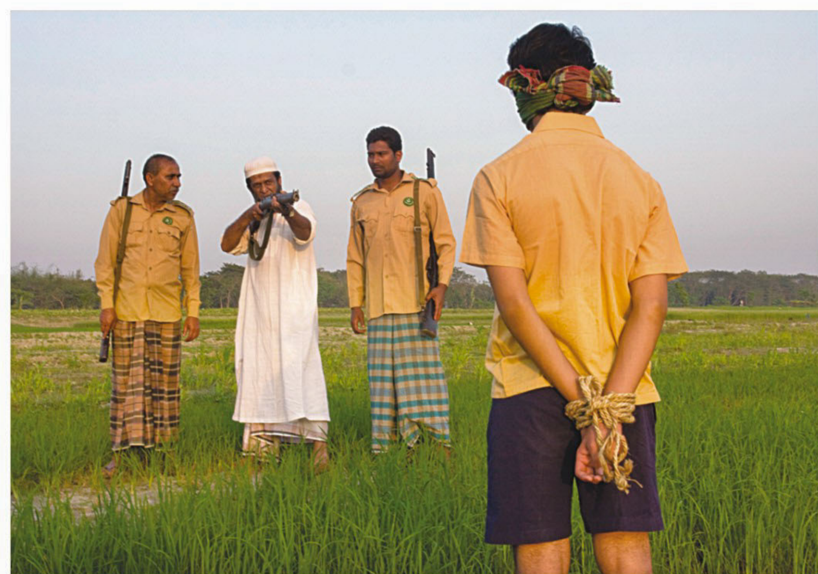
A scene from "Amar Bondhu Rashed"