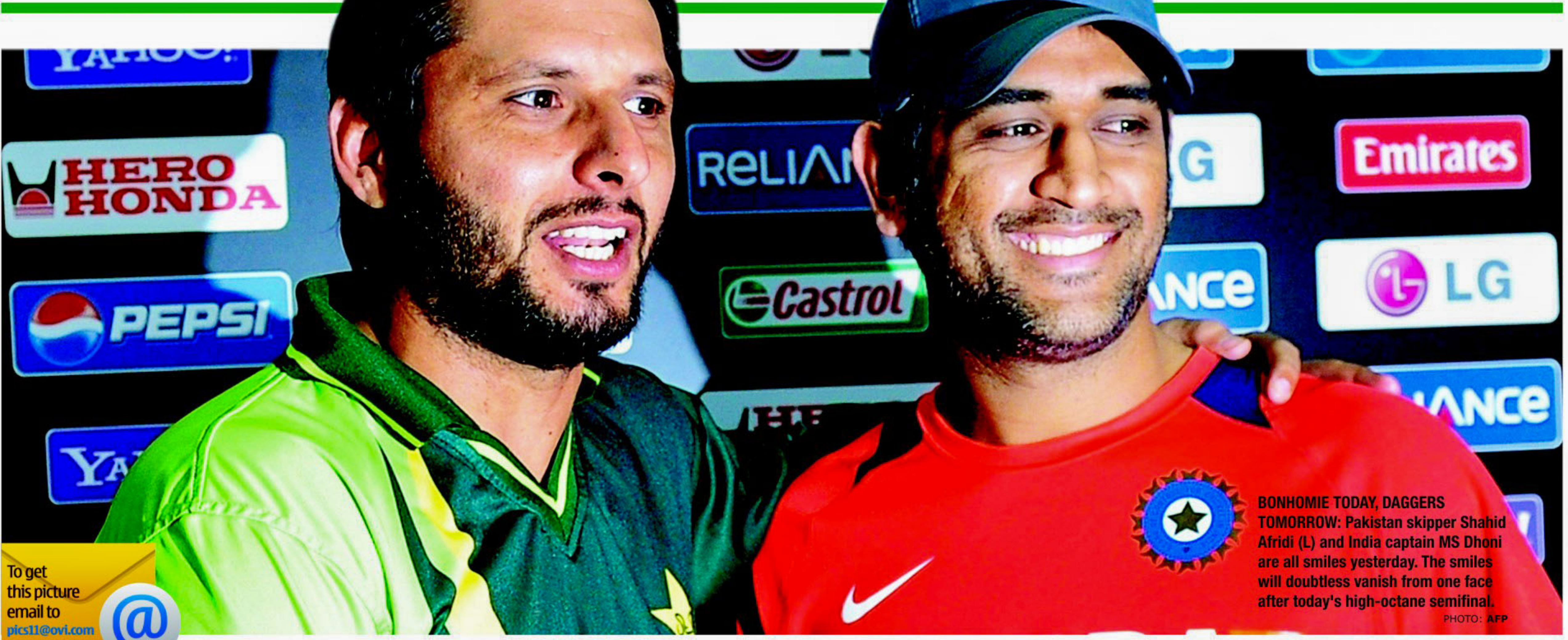
BONHOMIE TODAY, DAGGERS TOMORROW: Pakistan skipper Shahid Afridi (L) and India captain MS Dhoni are all smiles yesterday. The smiles will doubtless vanish from one face after today's high-octane semifinal.

To get this picture email to pics11@ovi.com @