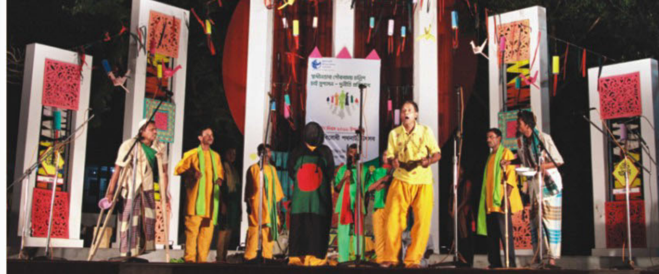
Bhumihi Shangkshkritik Dal, Tangail stage its production "Shadhinota" at the festival.

To mark the 40th anniversary of Independence as well World Theatre Day, Transparency International Bangladesh (TIB) arranged a two-day-long street theatre festival at the Central Shaheed Minar premises in Dhaka. The festival ended on March 28. TIB's main goal, generating awareness against corruption, was highlighted through the plays. Theatre troupes from different parts of the country staged plays that also addressed the Liberation War, Language Movement, trial of war criminals and other issues.