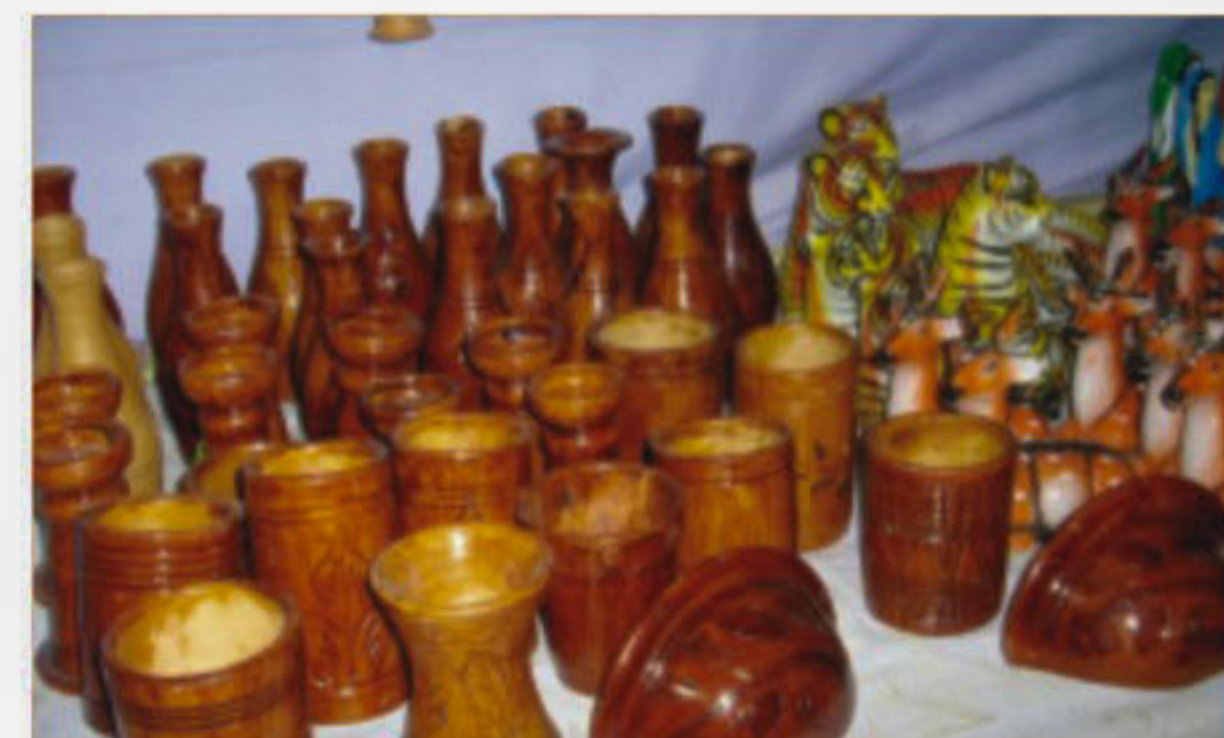
A total of 110 stalls including handicraft shops have been set up at the fair.

Rashidul Islam, sales executive of Gulu Handicrafts asserted that although the company has displayed its products for the first time in Mymensingh, the turnout of visitors is very impressive.