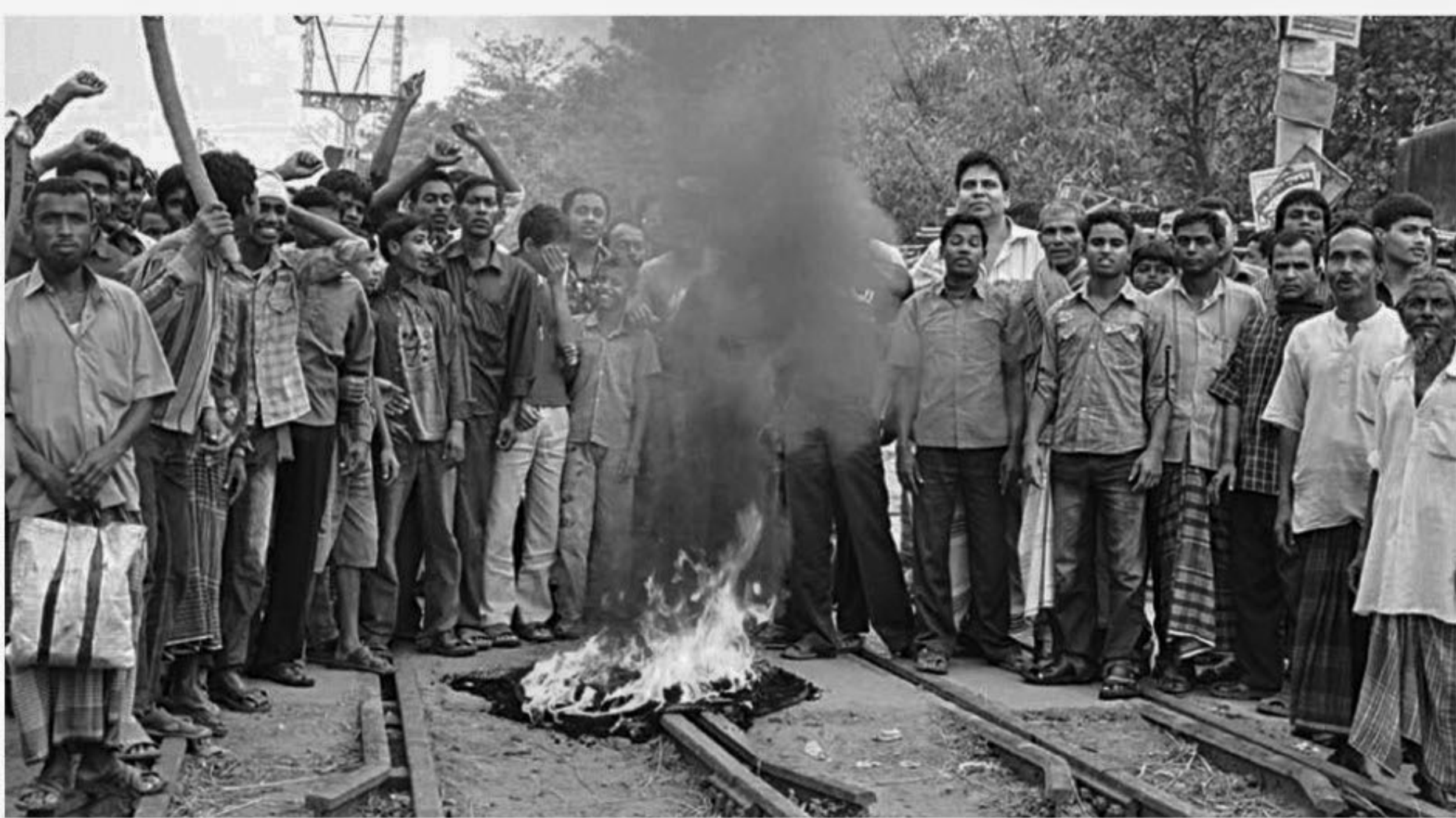
Supporters of National Committee for Protection of Oil, Gas, Mineral Resources, Power and Port set fire to the rail tracks during their six-hour-long road, rail blockade programme in Phulbari upazila of Dinajpur district yesterday protesting the government's move for open pit mining at Barapukuria.