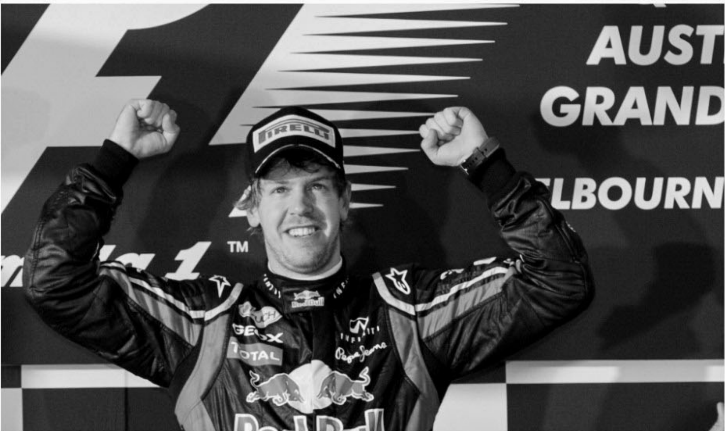
Red Bull-Renault driver and reigning world champion Sebastian Vettel of celebrates on the podium after winning Formula One's Australian Grand Prix in Melbourne on Sunday.