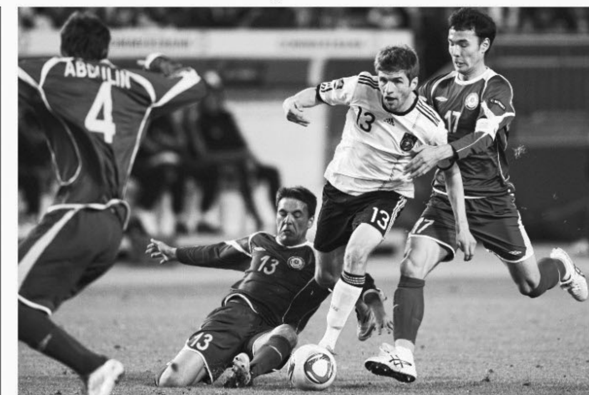
Germany starlet Thomas Mueller wiggles past the challenges of Kazakhstan players during their 4-0 qualifying win at Kaiserslautern on Saturday.