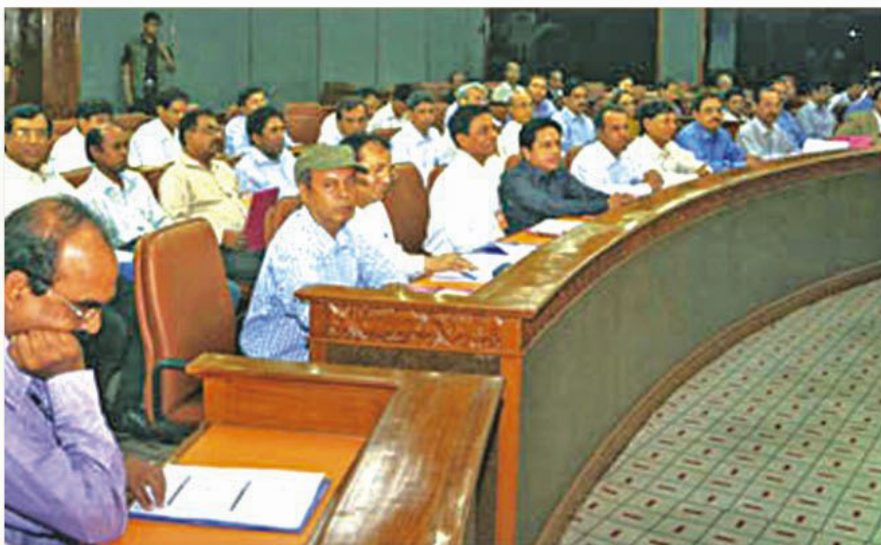
Prime Minister Sheikh Hasina speaks at a meeting with the high officials of National Board of Revenue (NBR) and its commissioners at her office in the city yesterday. (Story on B1)

The scientist sees very bright prospect of using the new product in Bangladesh because of availability of natural raw materials.