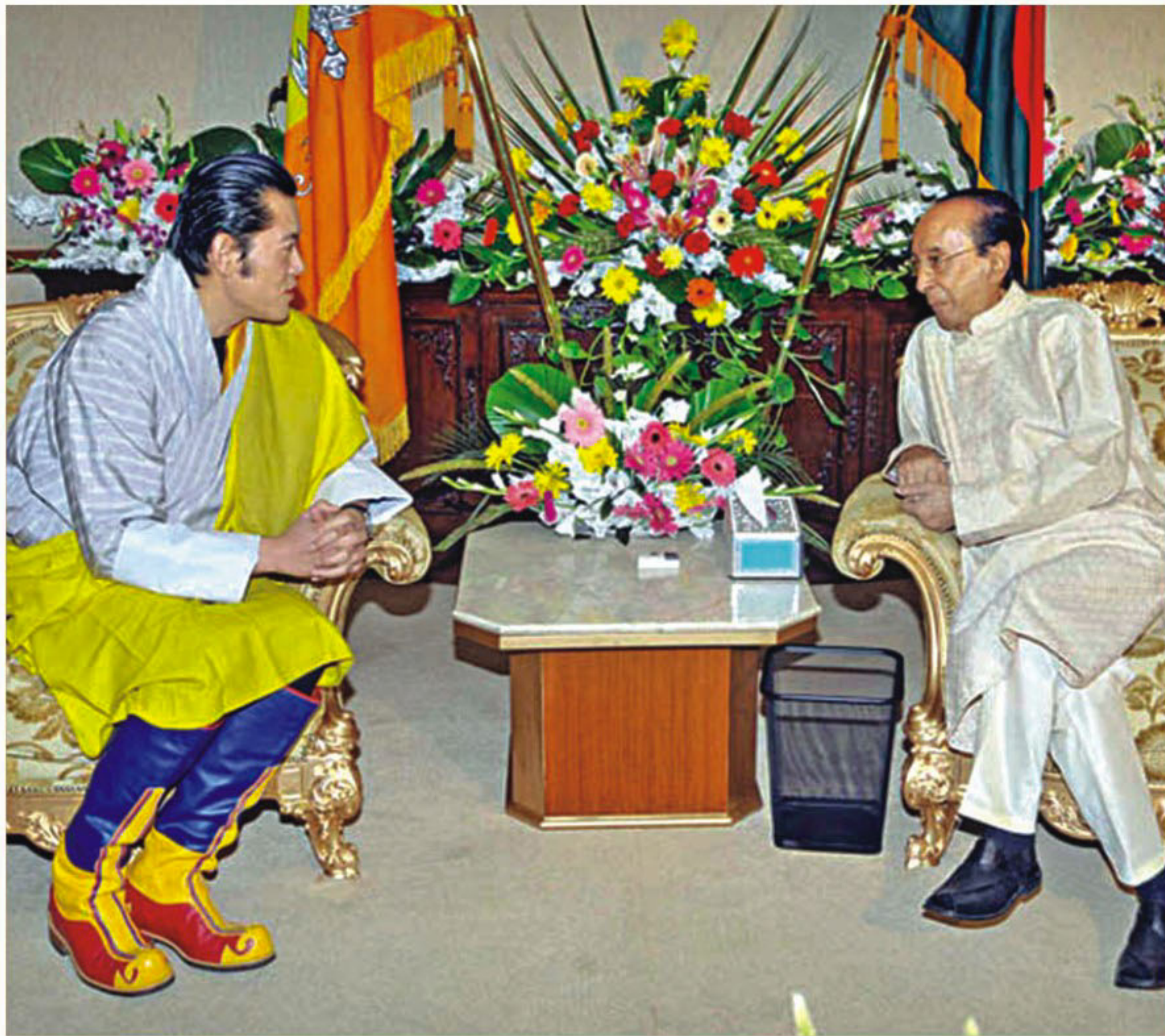
King of Bhutan Jigme Khesar Namgyel Wangchuck calls on President Zillur Rahman at Bangabhaban in the city yesterday.

They urged the prime minister to take necessary steps to stop the hill cutting.