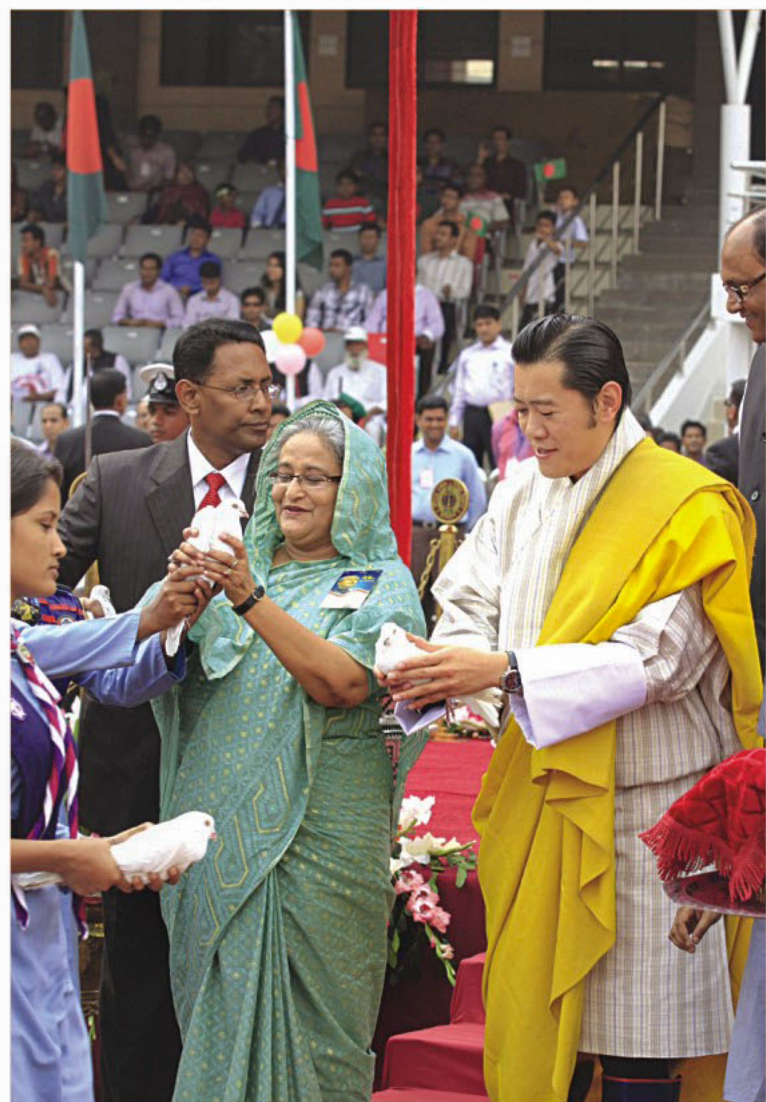
Prime Minister Sheikh Hasina and Bhutanese King Jigme Khesar Namgyel Wangchuk inaugurate a children's rally and independence parade by releasing pigeons at Bangabandhu National Stadium in the city yesterday.

Hasina said the future generation must know the true history of the nation's hard-earned victory and the supreme sacrifices made by the patriotic countrymen for their motherland.