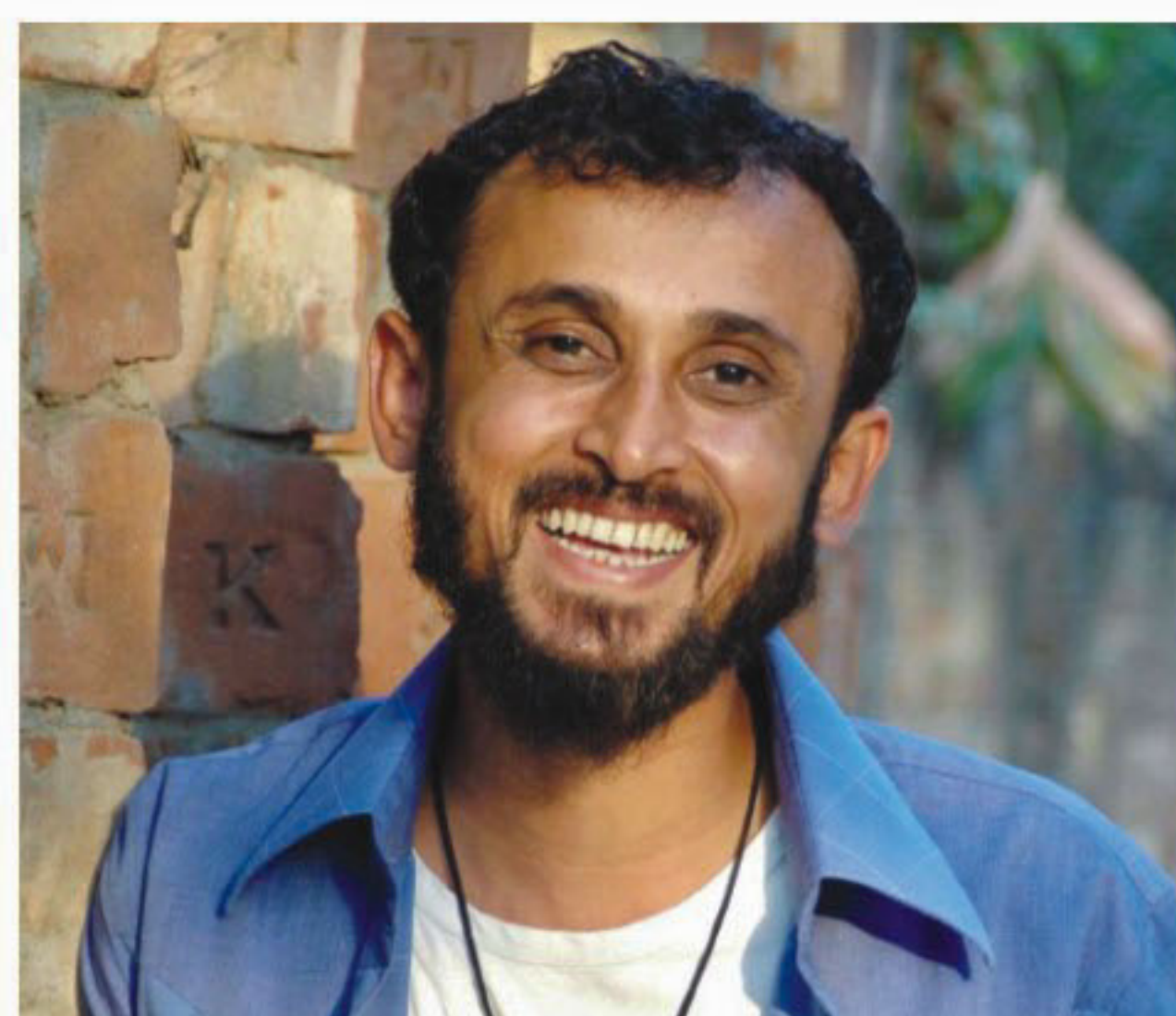
Mostafa Sarwar Farooki