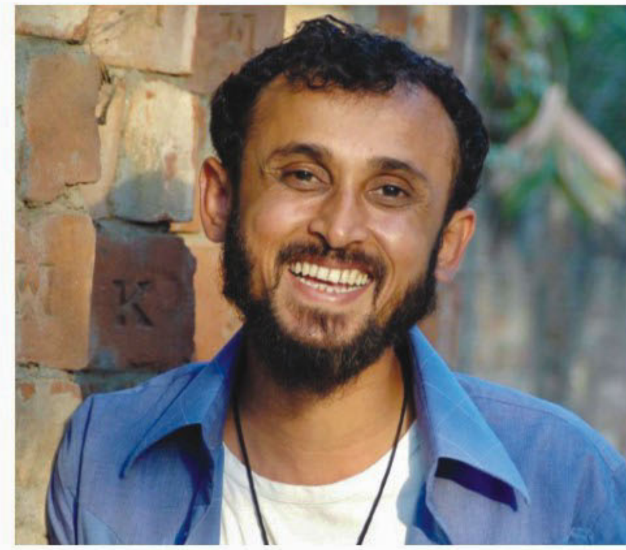
Mostafa Sarwar Farooki