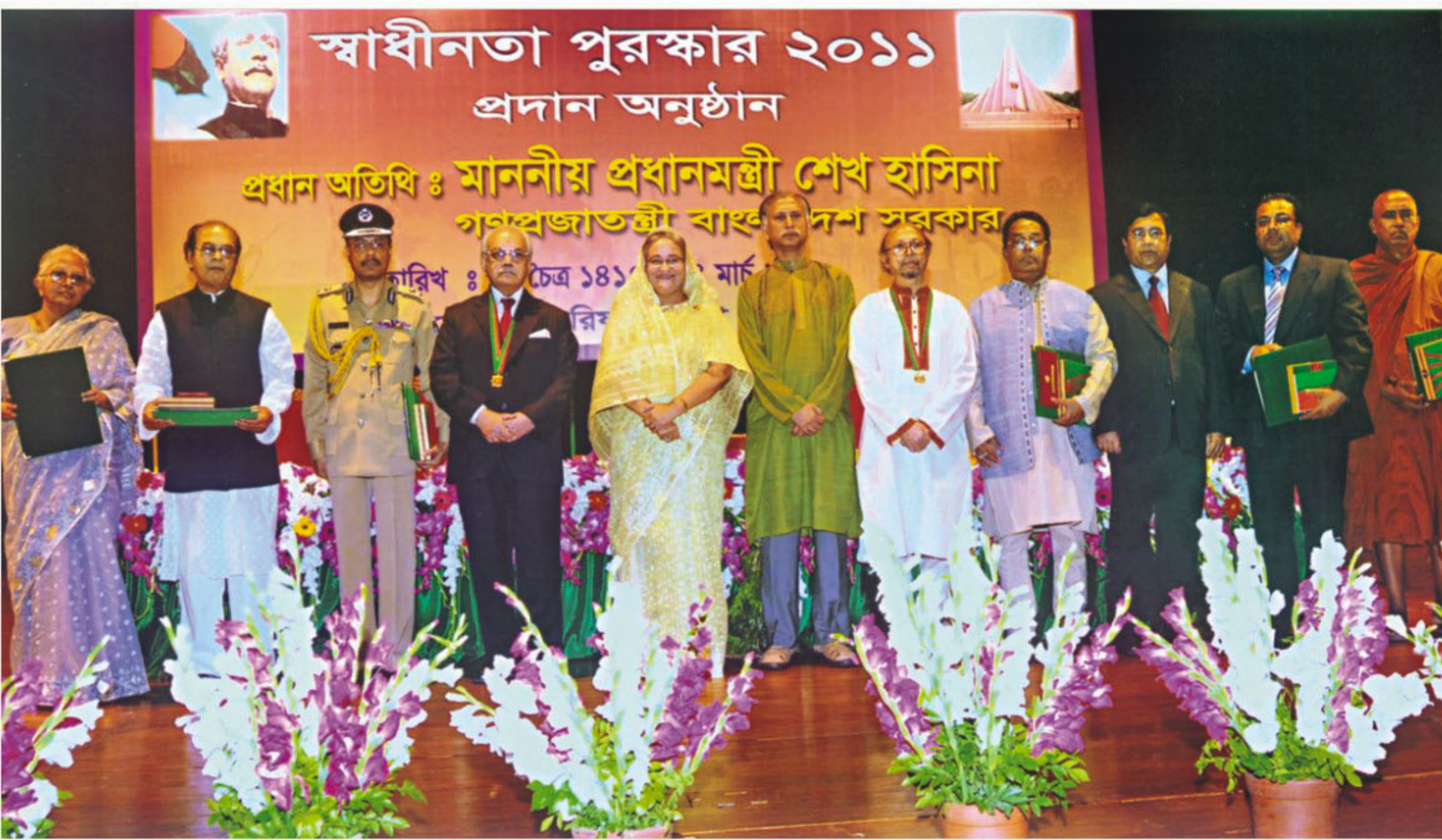
Prime Minister Sheikh Hasina with recipients of the Independence Award 2011 at Osmani Smriti Auditorium in the city yesterday. Seven personalities, Dhaka University and Bangladesh Police were given the accolade this year.