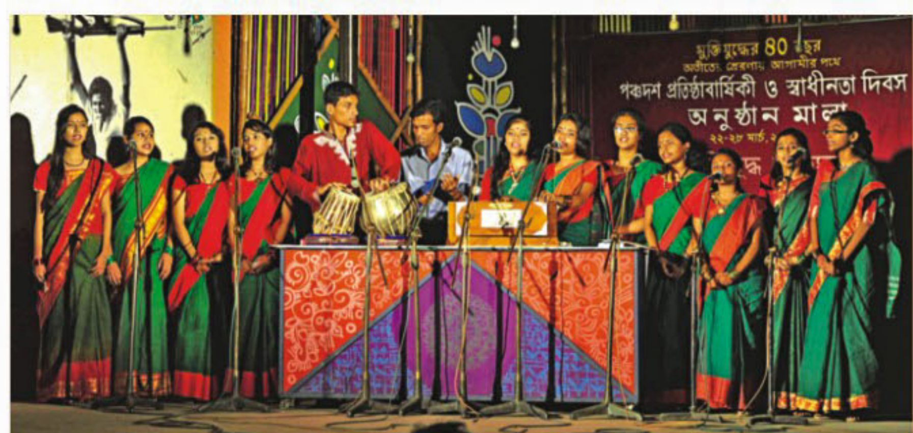
Artists perform a country song at the weeklong programme at Liberation War Museum in the city yesterday, marking the 40th Independence Day tomorrow.

107 Kart Nasirul Islam Avenue, Dhaka-1215 or GPO Box 3395, Dhaka, Bangladesh. Tel: (880) 2 8111005 Fax: (880) 2 8113324 E-mail: dhaka@panpacific.com Visit: www.panpacific.com/dhaka