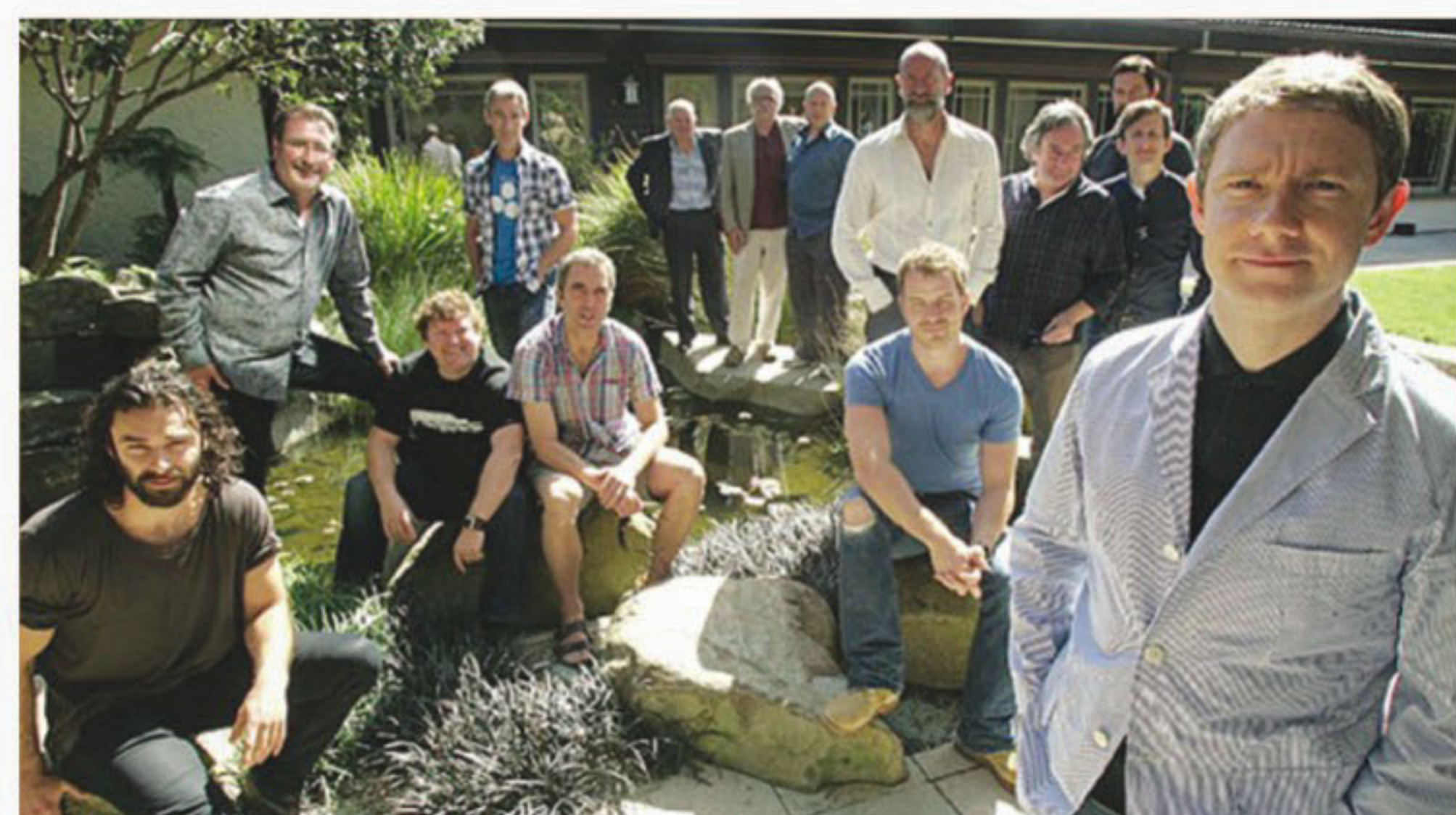
The cast and crew of "The Hobbit".

Filming on the two Hobbit movies has begun following months of delays caused by funding problems, a row over actors' wages and surgery for its director. Filming is taking place at Stone Street Studios, Wellington, and on location around New Zealand. Production on the films, starring Martin Freeman as Bilbo Baggins, is expected to take up to two years. The first is due out in late 2012. In January, director Peter Jackson had surgery for a perforated ulcer. Studios Warner Bros and New Line had previously considered taking the production away from New Zealand after acting unions threatened to boycott the films in protest over payments. The unions had complained of inconsistencies in the terms and conditions of New Zealand actors and other production workers compared with their overseas colleagues. They said they would strike if their demands for a collective contract were not met. In an open letter written at the time, Jackson warned that shifting the entire project to