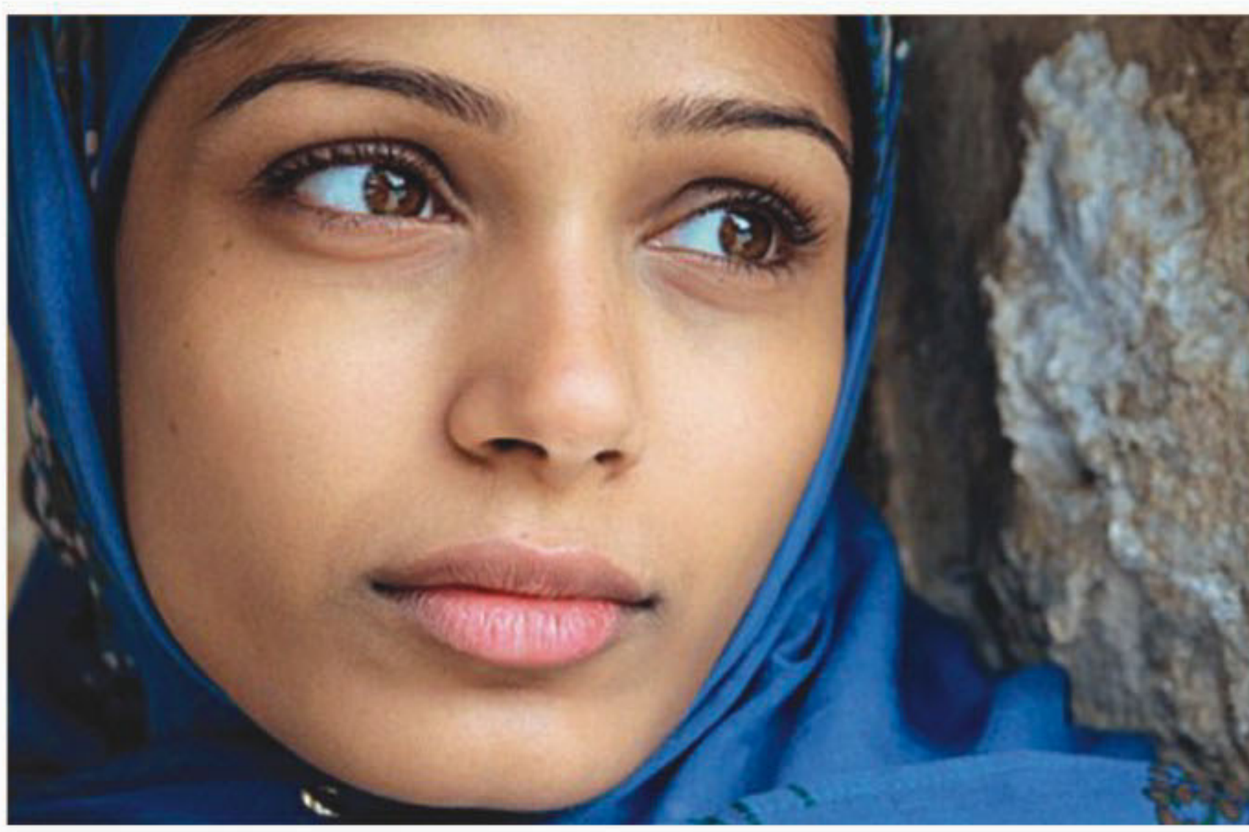
Freida Pinto in "Miral".

Israel won't exist anymore, and I don't want that to happen. The people who scream the loudest are not necessarily the sanest." Freida has said that she did not look at it as a political film. For her, it was a story of survival and keeping one's dignity intact under the most depressing, humiliating and violent circumstances. "Both Schnabel and writer Rula unambiguously decided that I should do the film," Freida said. Rula guided her to know Palestinian families and arranged for her to spend a couple of days with a family. Having the writer on the sets and at locations, Freida said, spurred her determination to give her best to the film. "I felt I had to do justice to this amazing woman," she said. She told British newspaper The Independent that she knew of the