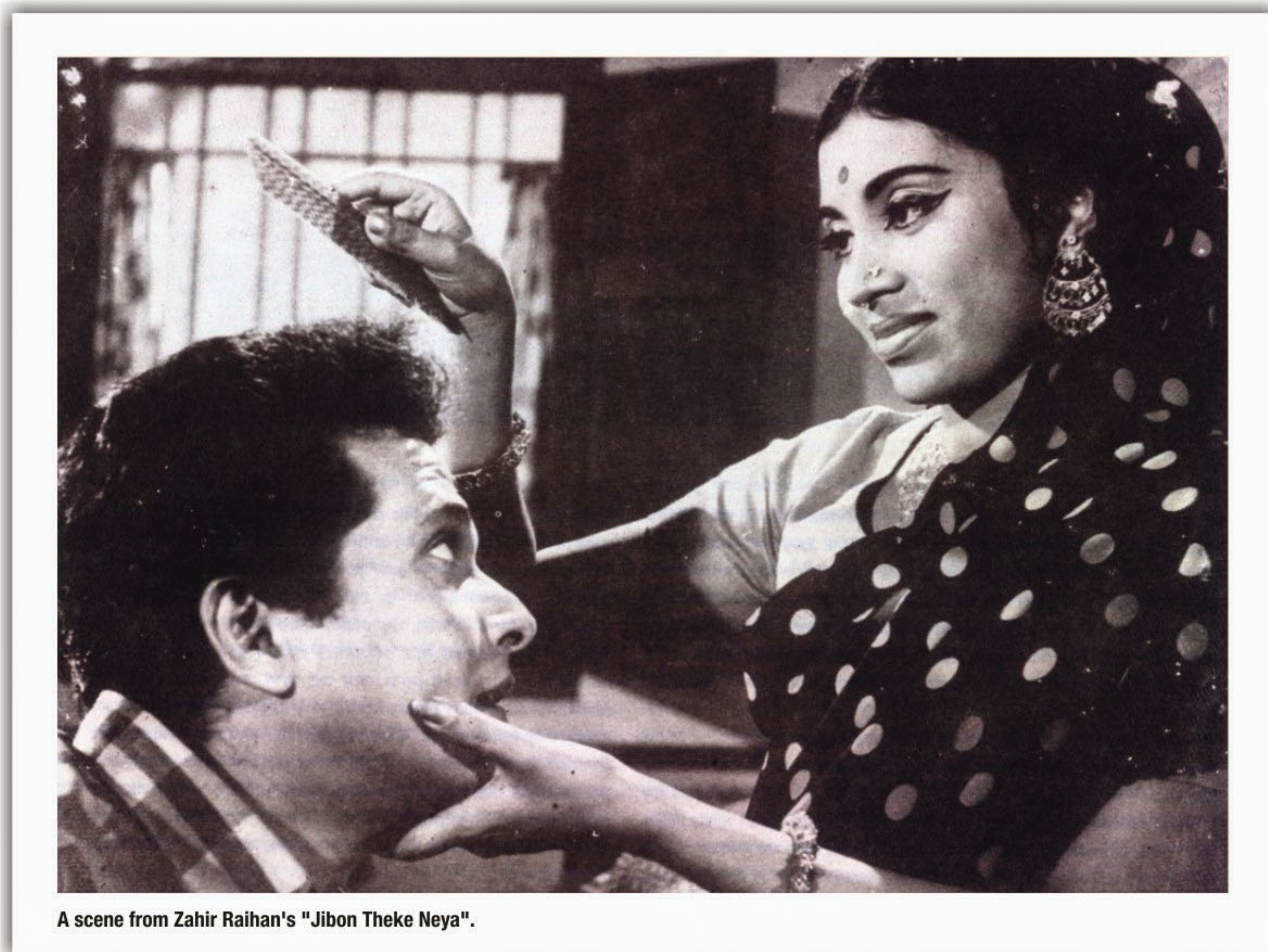
A scene from Zahir Raihan's "Jibon Theke Neya".