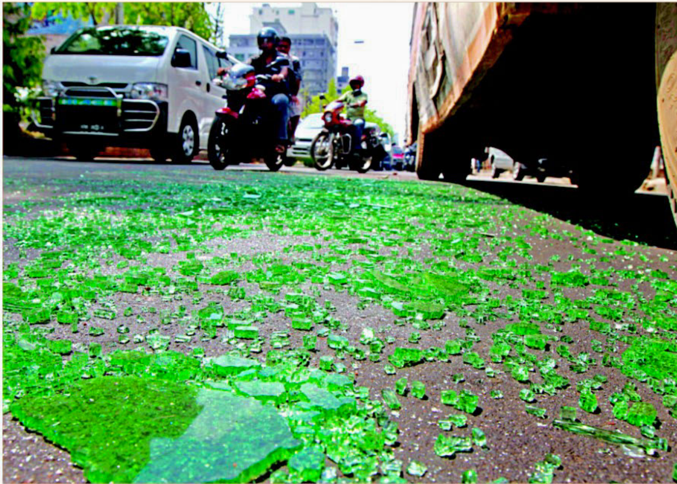
Shattered glass from a public bus, allegedly broken by students over an altercation with the bus helper, litters the road near Government Titumir College in Mohakhali of the city yesterday posing a threat to the passing vehicles.