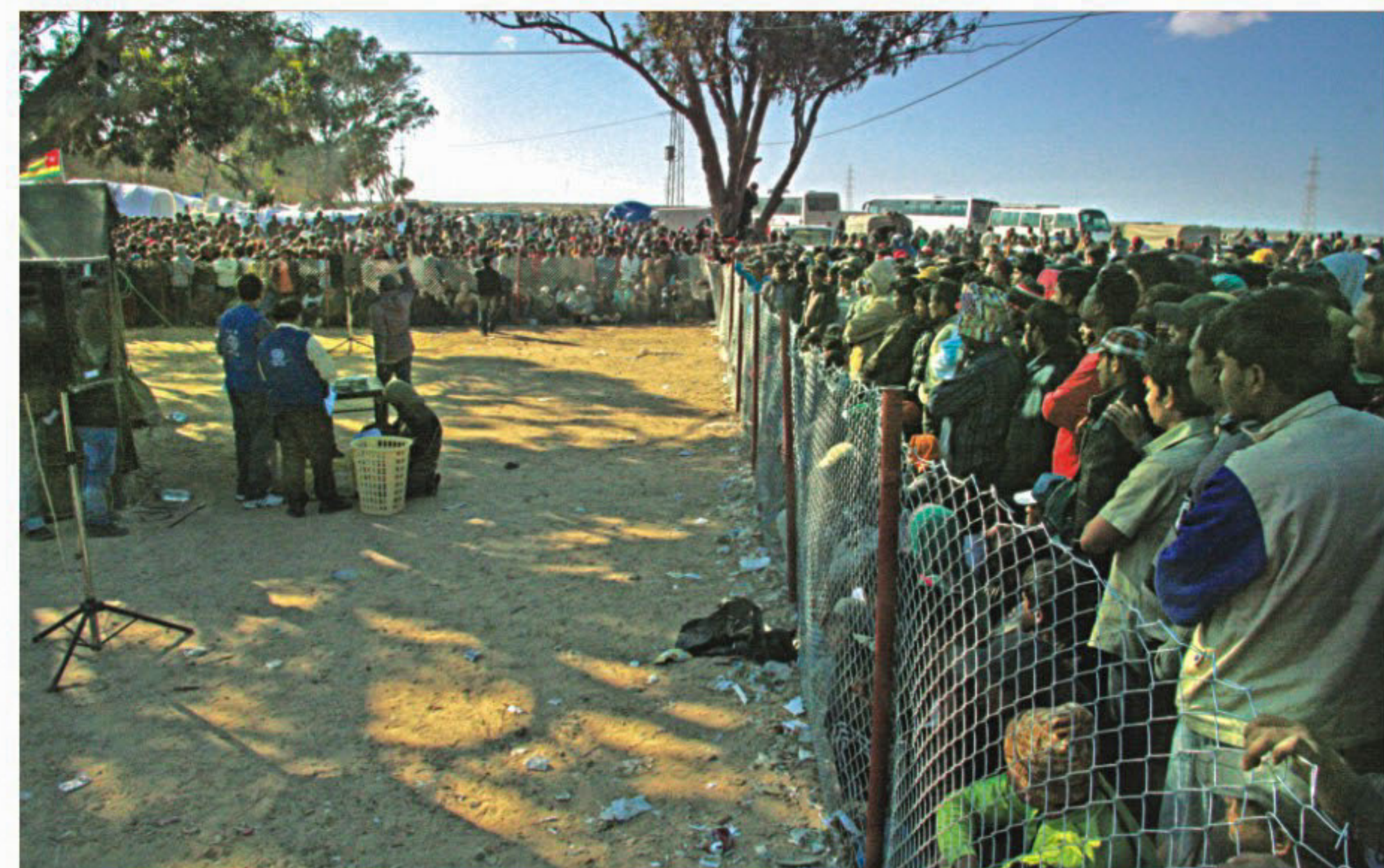
Bangladeshi workers at the Choucha camp on the Libya-Tunisia border waiting for a flight to return home.