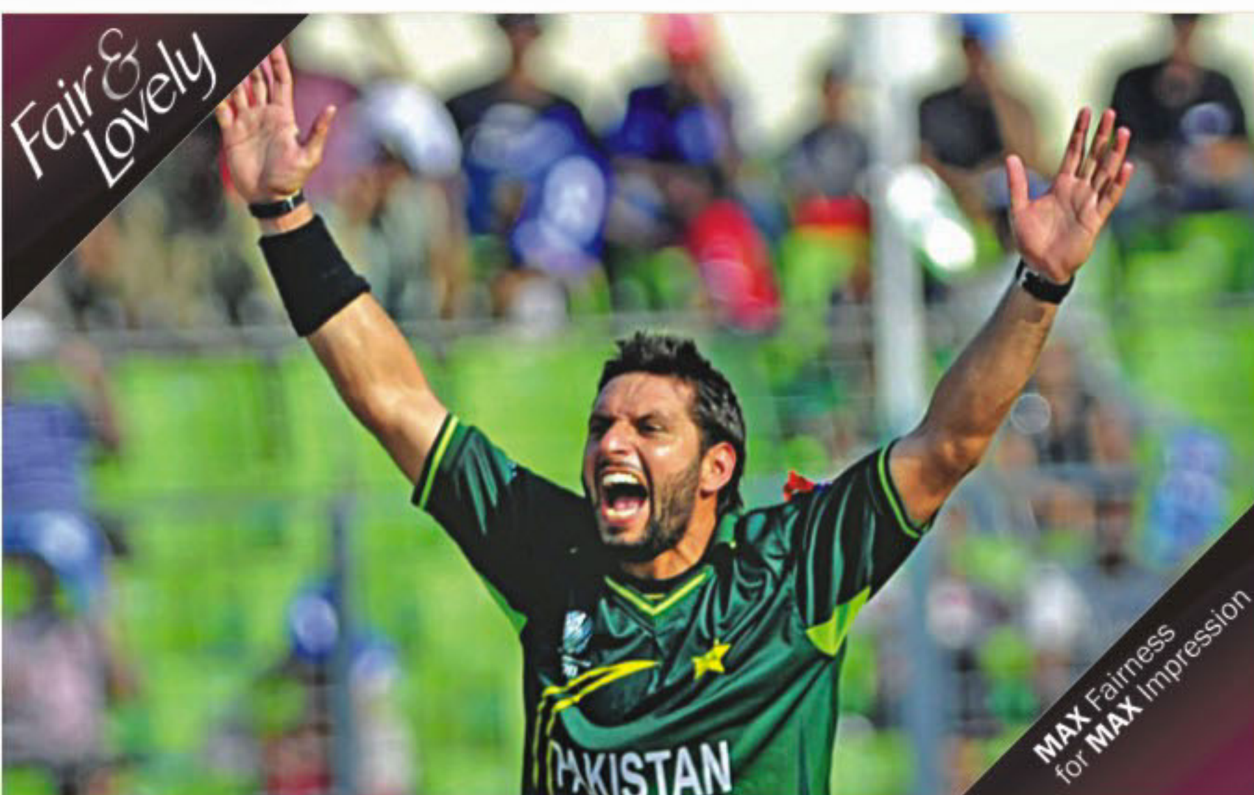
Shahid Afridi celebrates getting a West Indies wicket at Sher-e Bangla National Stadium in Dhaka yesterday.