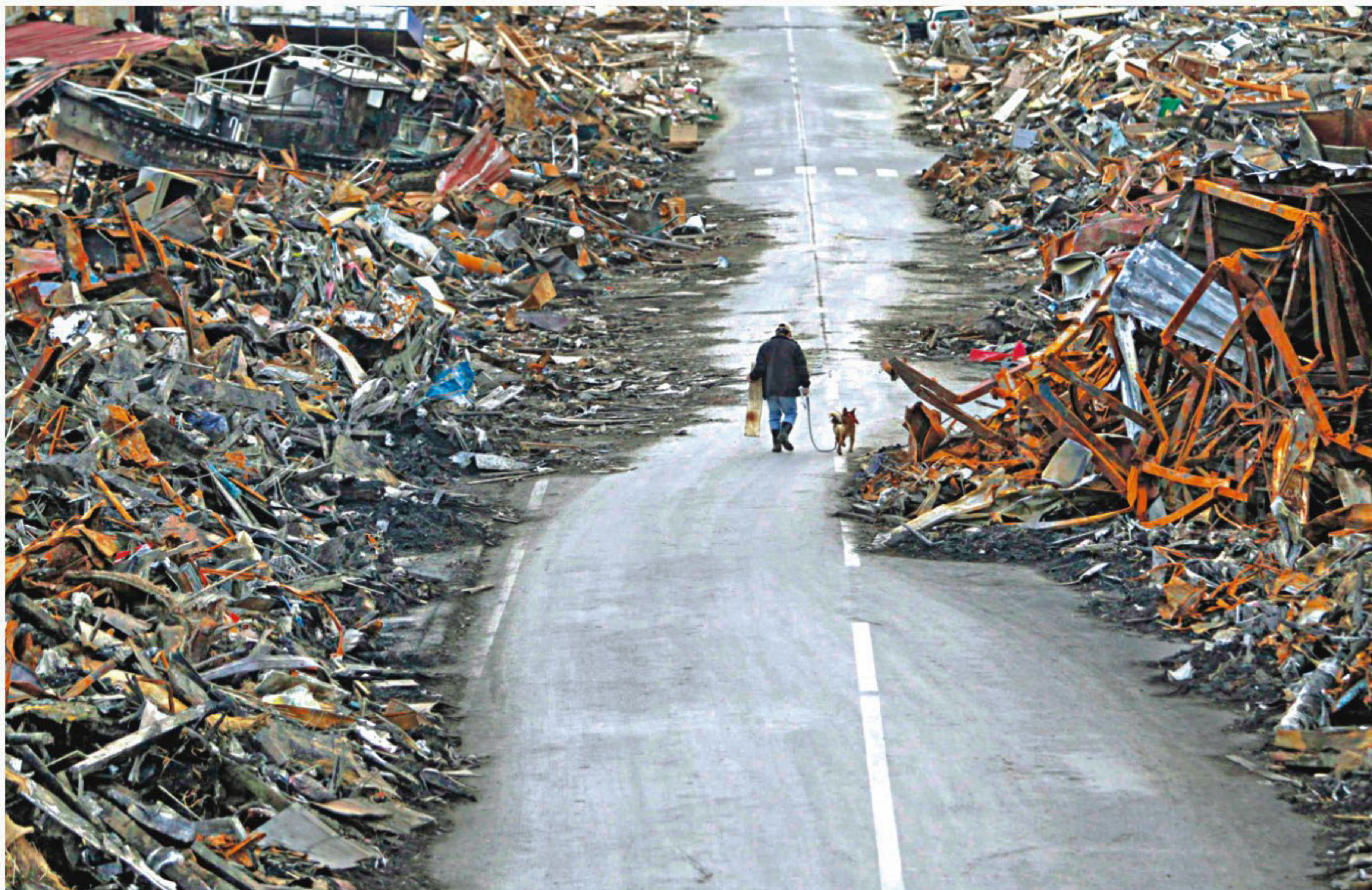
A man walks with his dog at a destroyed residential area of Kesenuma in Japan yesterday, nearly two weeks after the area was devastated by a magnitude 9.0 earthquake and tsunami.