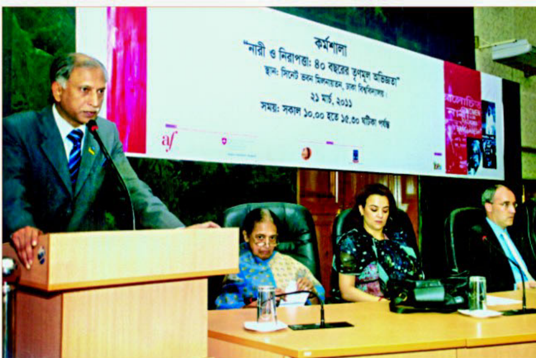
Dhaka University Vice Chancellor Prof AAMS Arefin Siddique speaks at a workshop titled "Security and women: Experiences of 40 years from grassroots level" at Nabab Nawab Ali Chowdhury Senate Bhaban of the university.

Bangladesh has urged restraint in the implementation of the UN Security Council Action on Libya "so that military action is resorted to only when absolutely essential and solely for neutralising military targets." In a press statement yesterday, the Foreign Ministry said for Bangladesh, the concern continues to be with regard to the safety of civilians, particularly of Bangladesh nationality, located in various parts of Libya. The statement says, "Bangladesh is closely following the evolving situation in Libya. We have taken note of the adoption of UN Security Council resolution 1973 (2011), which calls for immediate ceasefire inside Libya and a complete end to violence. "We welcome the fact that the resolution aims at protecting civilians and civilian populated areas under threat and excludes categorically an occupation force." Bangladesh also called for a dialogue within Libya to find a peaceful solution to the current crisis in line with the aspirations of the Libyan people.