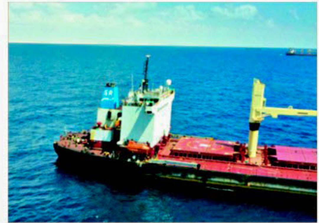
A snap of MV Jahan Moni.

A DEN OF PIRATES PAGE 9 ARRIVAL OF SAILORS IN PICTURES PAGE 3