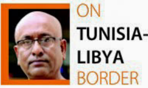
MORSHED ALI KHAN writes from the spot where thousands of Bangladeshi workers have taken shelter after fleeing the Libyan upheaval