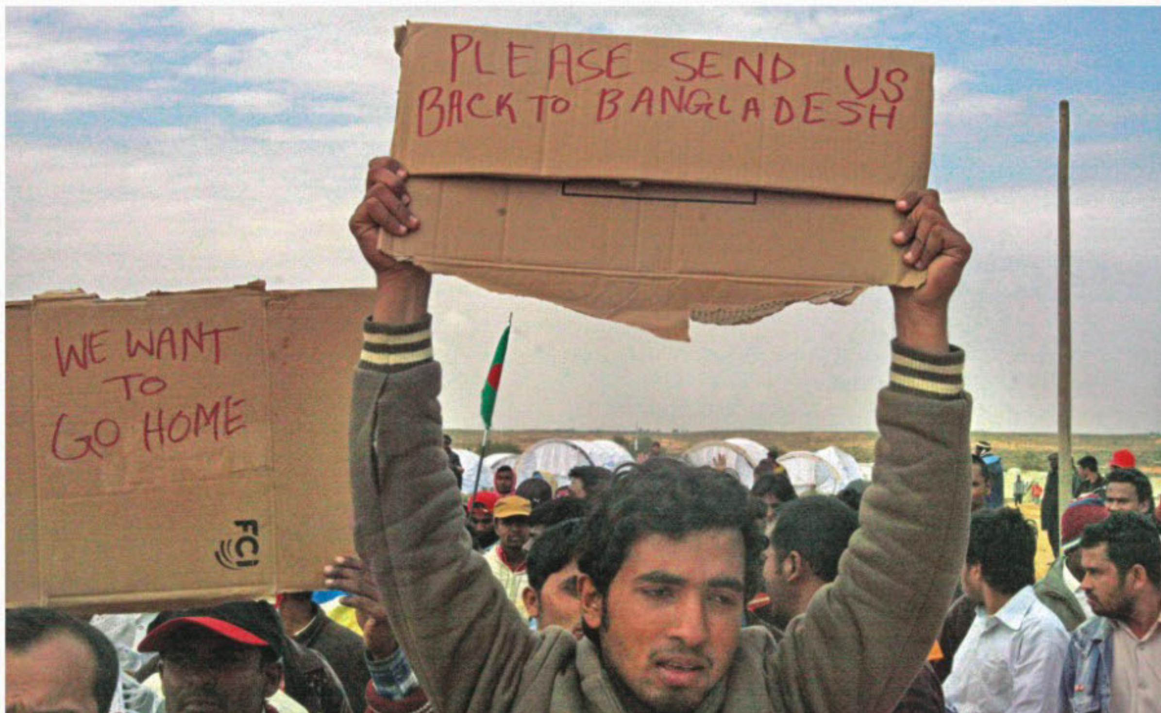
SEND US HOME: Bangladeshis stranded at the Tunisian refugee camp of Choucha wave placards during a demonstration for their immediate evacuation yesterday.