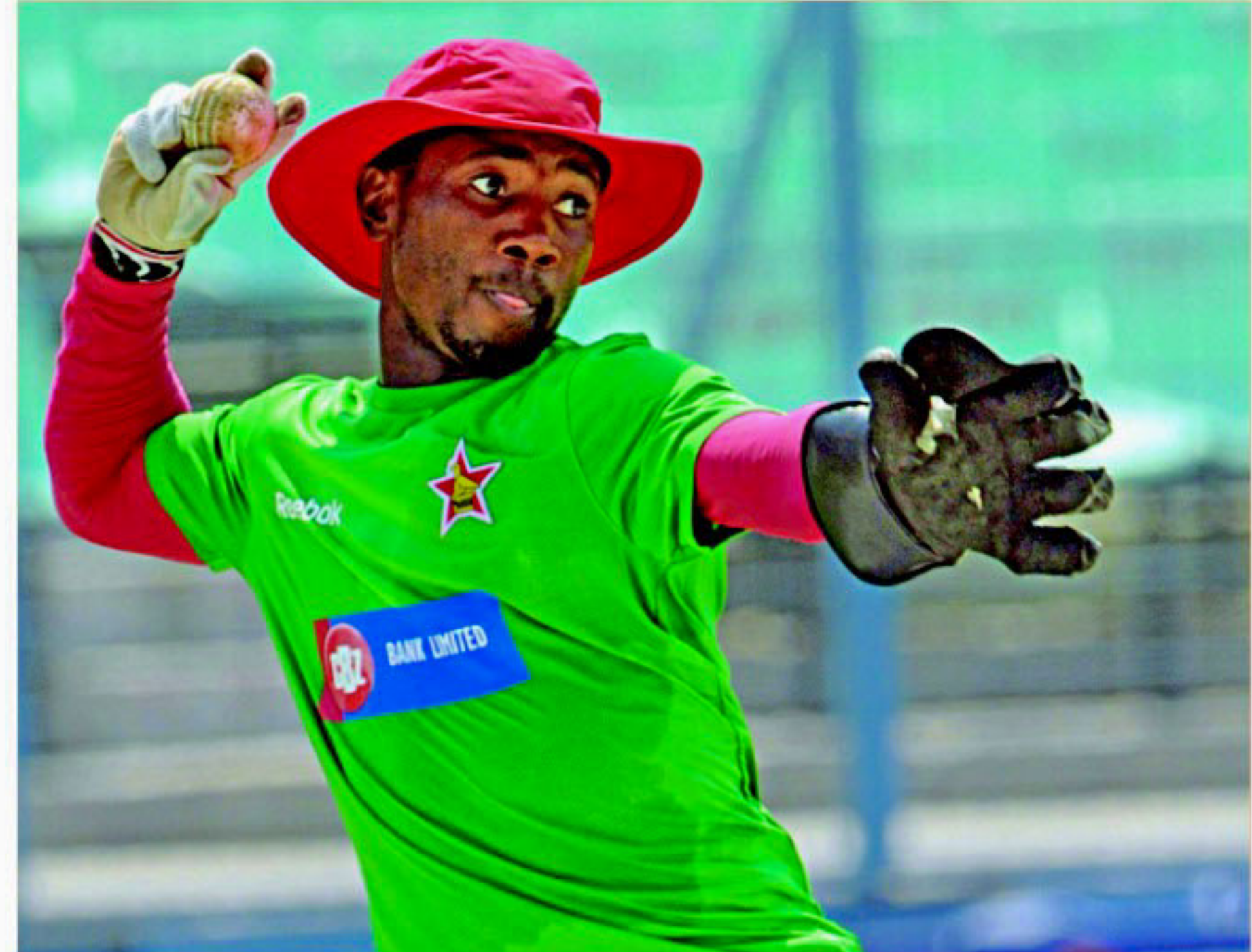
Zimbabwe wicketkeeper Tatenda Taibu is about to throw a ball during practice at the Eden Gardens in Kolkata yesterday, ahead of today's World Cup match against Kenya here.