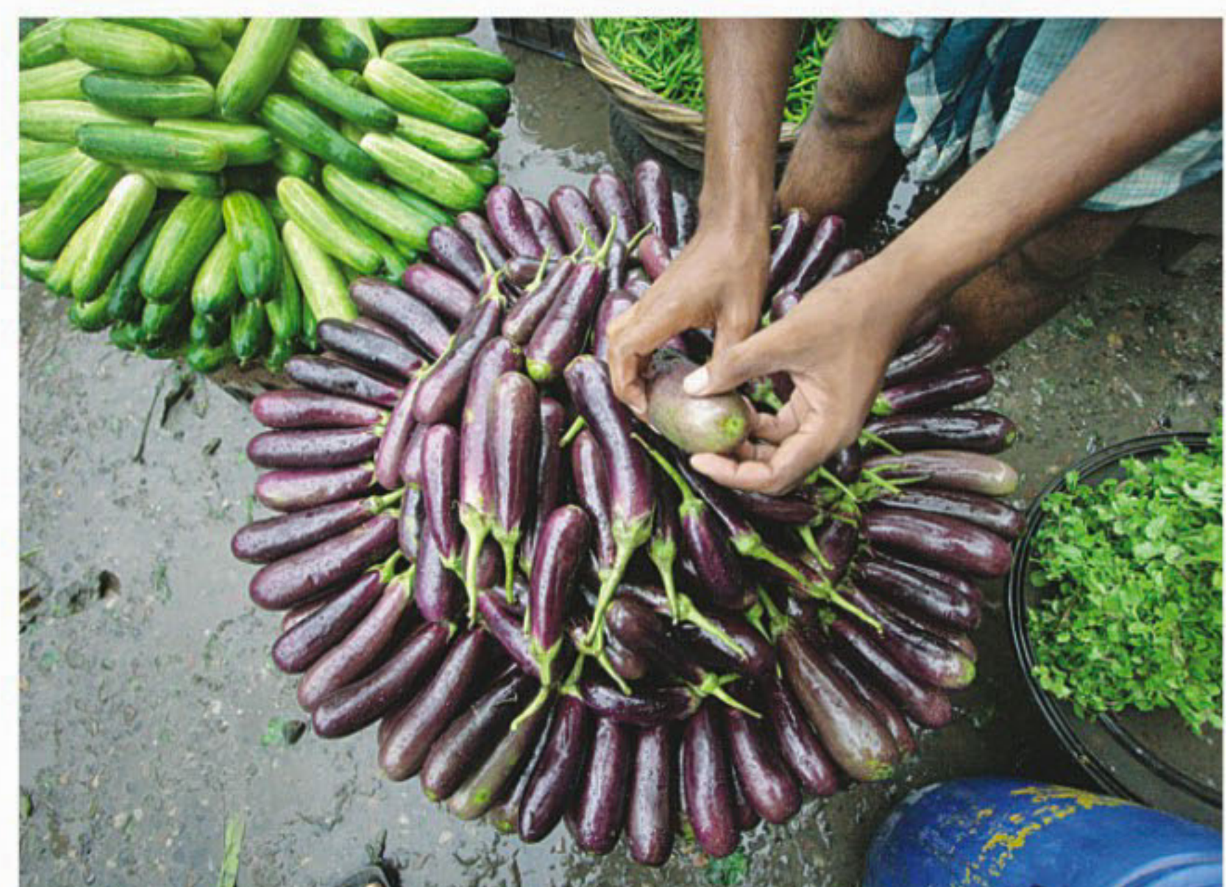
A.M.AHAD / DRINKNEWS

deserts ruling for over eighty years now! Can the balance tilt now, in a matter of say eighty days! One wonders!