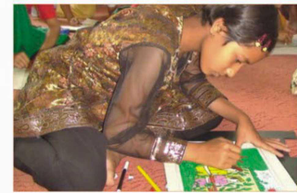
His Vision of Bangladesh."

Marking the 91st birth anniversary of Bangabandhu Sheikh Mujibur Rahman, Jatiya Kobi Kazi Nazrul Islam University in Trishal organised painting and essay competitions at its Arts Faculty building on March 17.