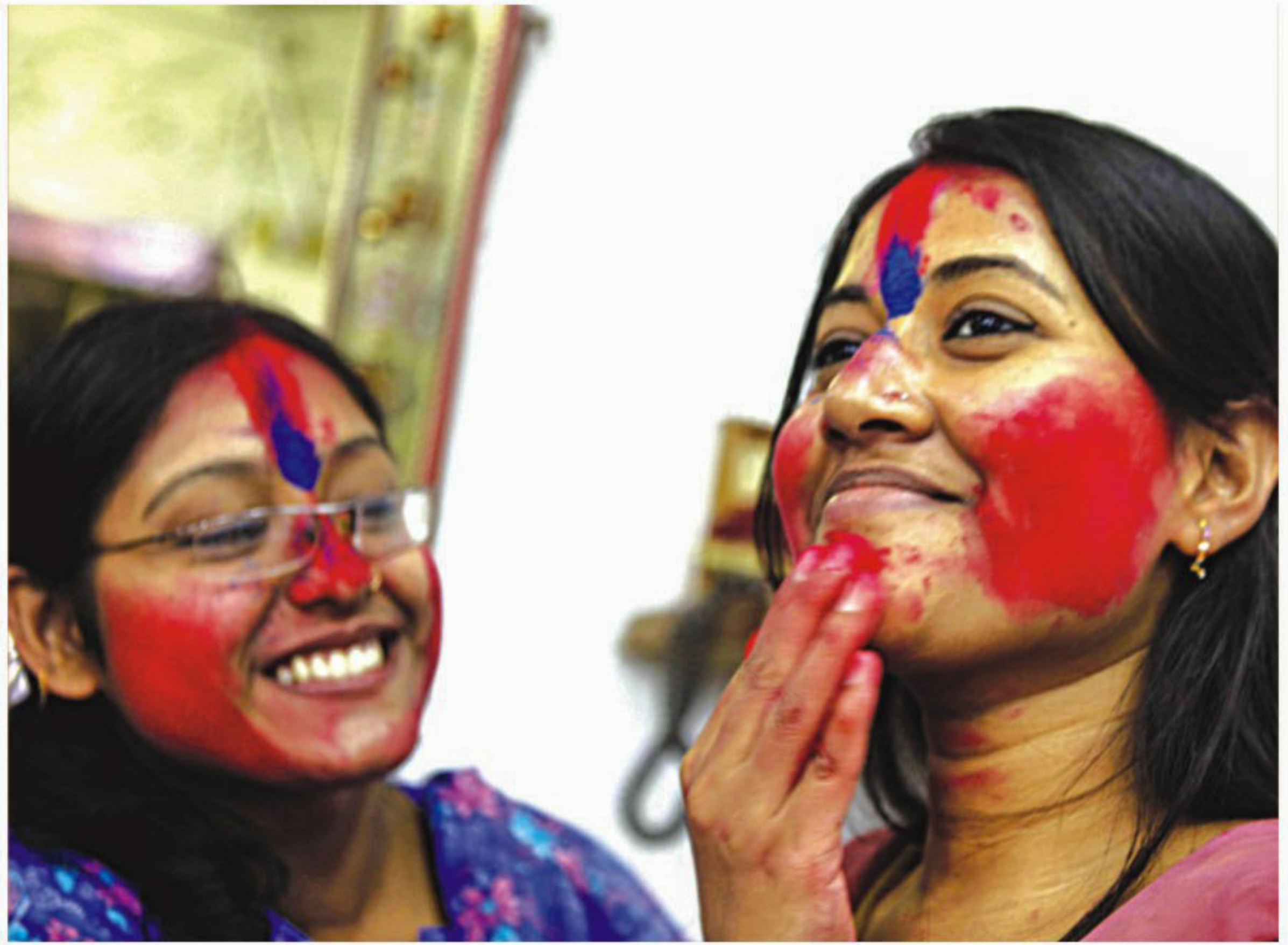
Enthusiast Hindu youths celebrate Dol Purnima, the eve of festival of colours, at Shankhari Bazar in Old Dhaka yesterday.