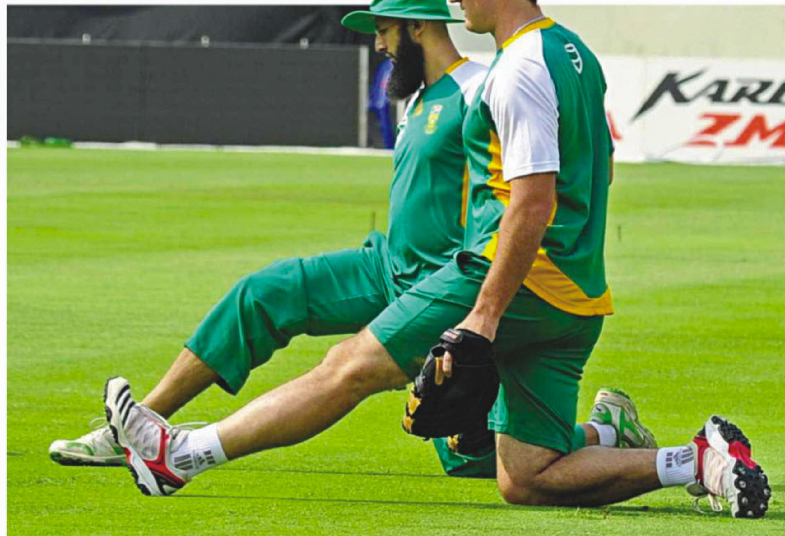
South Africa captain Graeme Smith (R) and his opening partner Hashim Amla limber up at the Sher-e-Bangla National Stadium in Mirpur yesterday for their last group match against Bangladesh today.