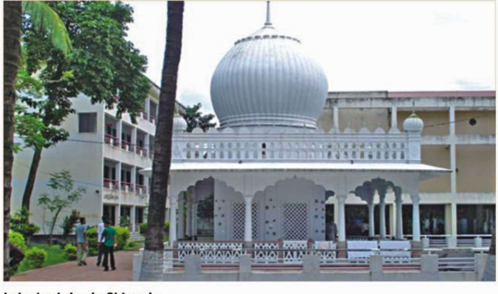
Lalon's shrine in Chheuria.