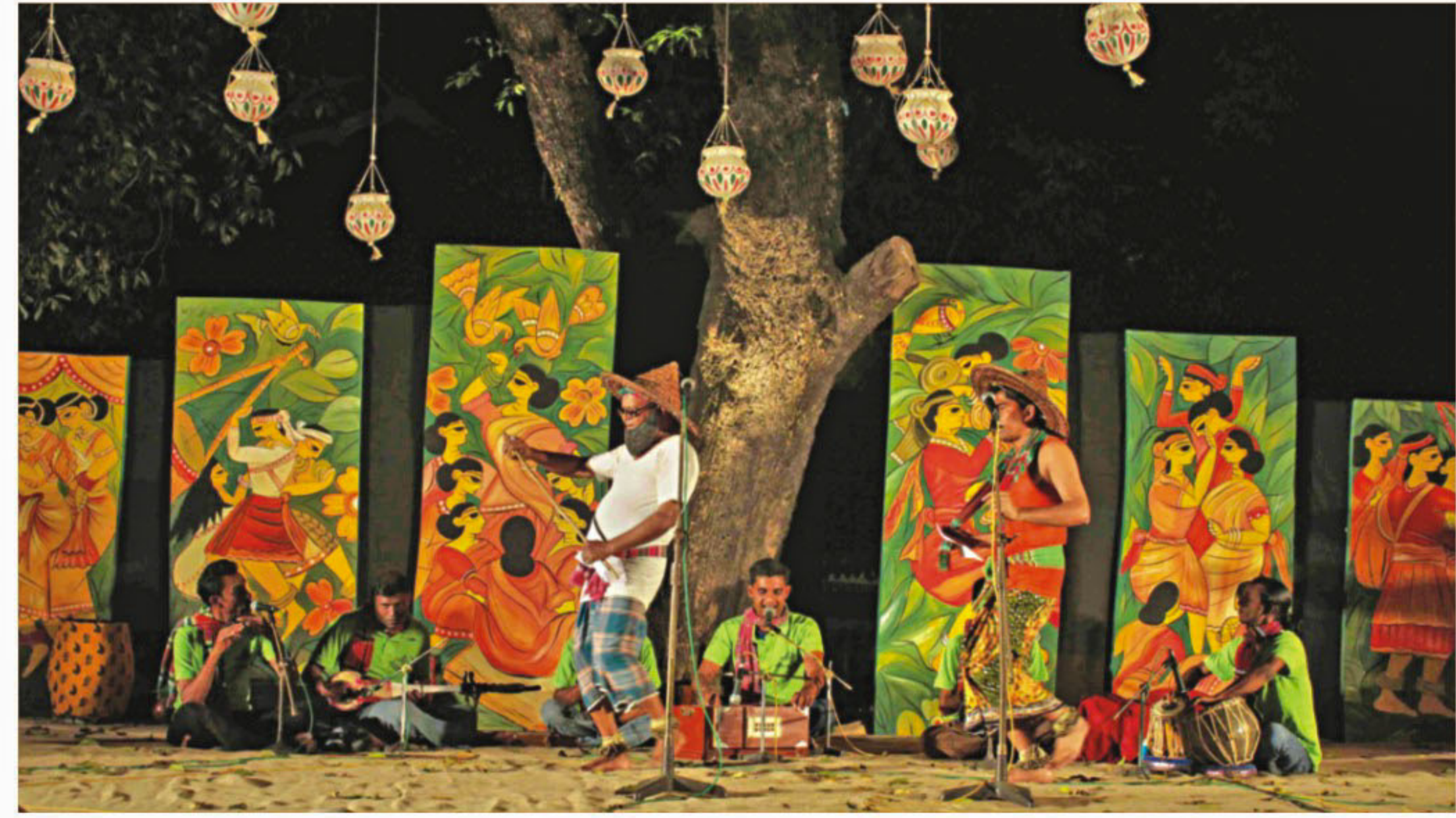
The nightlong programme highlighted the opulent heritage of Bengali folk music and its sub-genres.