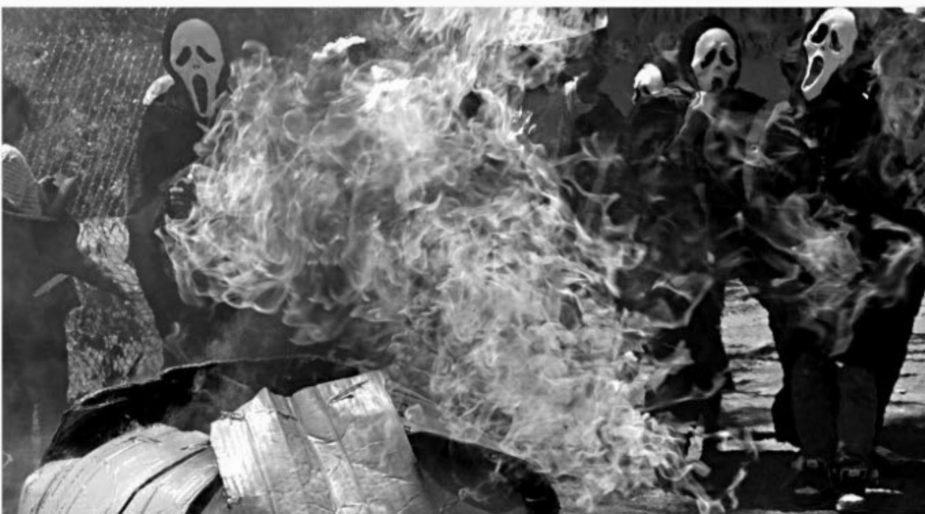
Anti-nuclear activists wearing masks react as they burn a mock nuclear power plant reactor during a protest outside the Bataan Nuclear Power plant in Morong town, Bataan province, northwest of Manila yesterday.