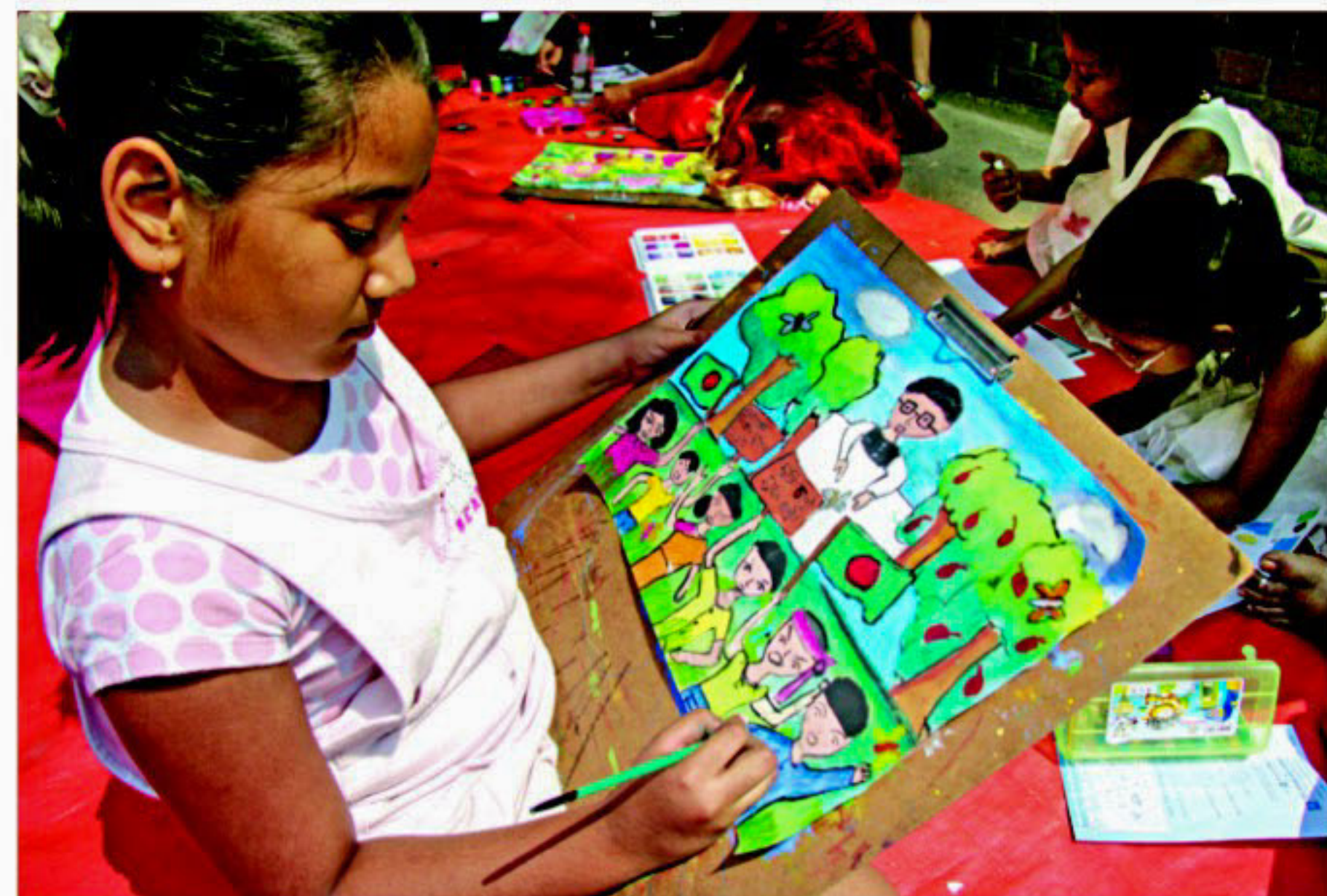
Children busy drawing at a competition organised by Patua Kamrul Hasan Art School at the National Museum in the city yesterday marking the 91st birthday of Bangabandhu Sheikh Mujibur Rahman.