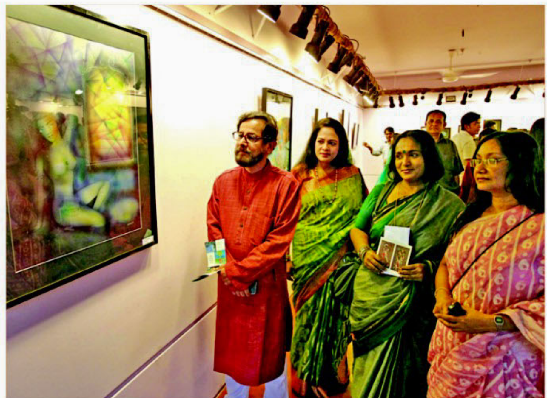
Lawmaker Asaduzzaman Noor views a painting on display after inaugurating a weeklong exhibition "Women in Nature" at Drik Gallery in the city yesterday.

Attorney General Mahbub Alam told The Daily Star that there is no confusion in exercising Article 116 of Constitution, since the government is dealing with posting, promotion, and grant of leave of lower court judges in consultation with the SC as per the directive of Masdar Hossain case.