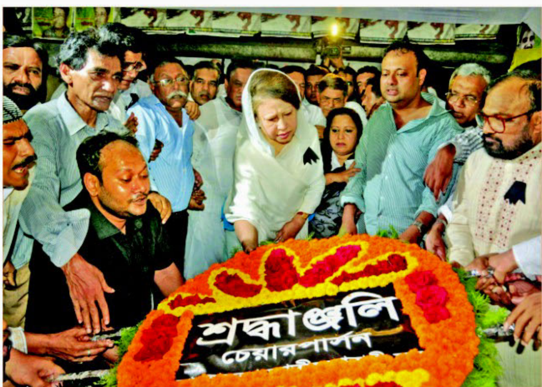
Leader of the Opposition in Parliament and BNP Chairperson Khaleda Zia places wreath at the coffin of the party's secretary general Khandaker Delwar Hossain at its Naya Paltan office yesterday. (Story on Page 1)