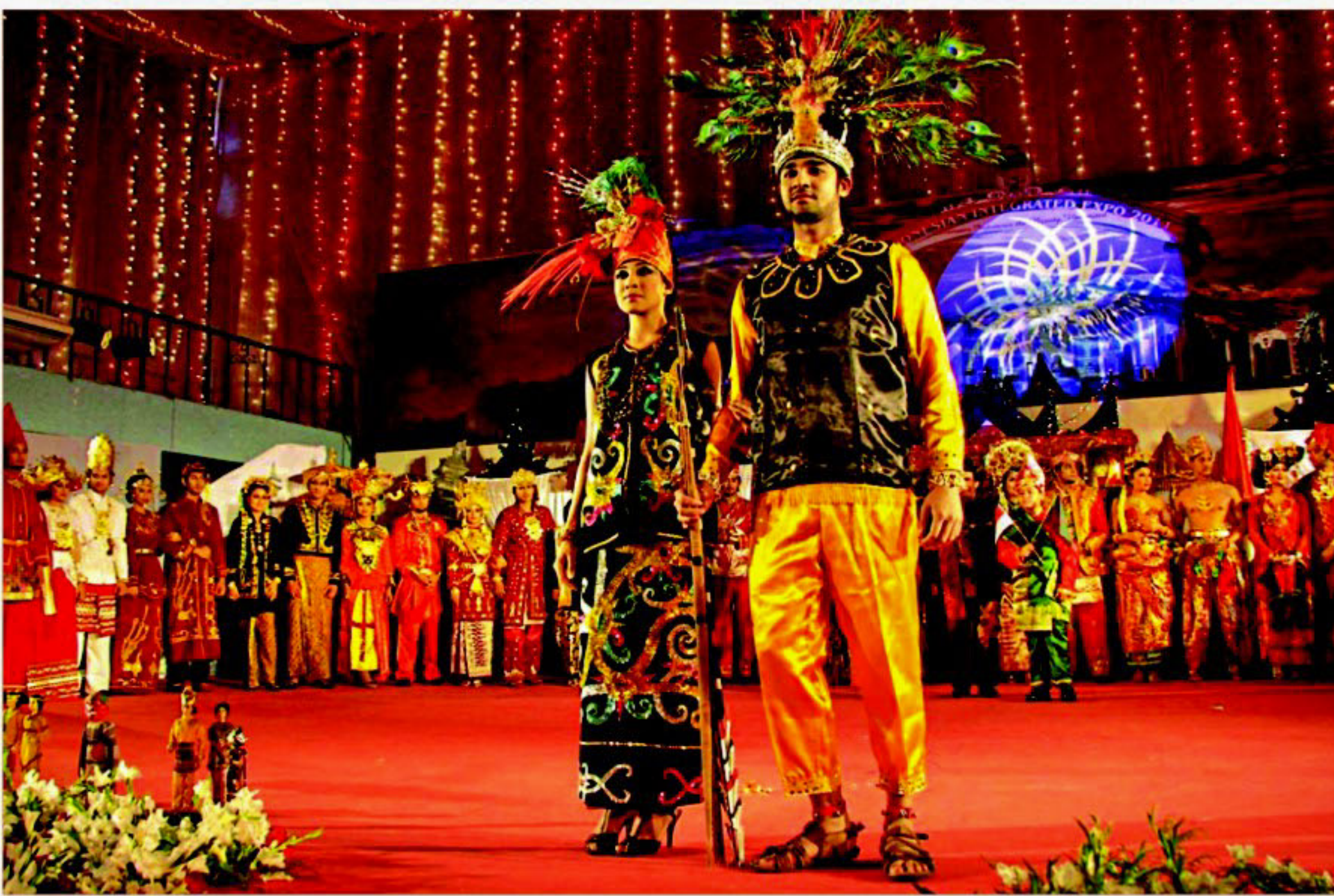
Models walk down the ramp at a fashion show during the three-day long Indonesia Expo organised by the Indonesian government at MA Aziz stadium gymnasium in Chittagong yesterday.