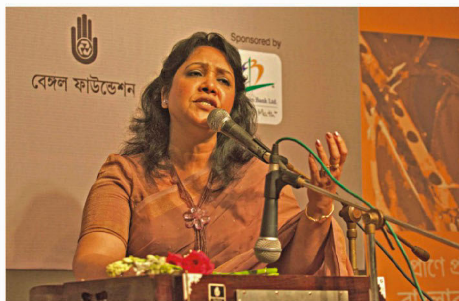
Pilu, two songs -- "Bhor Holo Bibhabori" and "Tumi Na Eley Jalsha Gharey" followed.