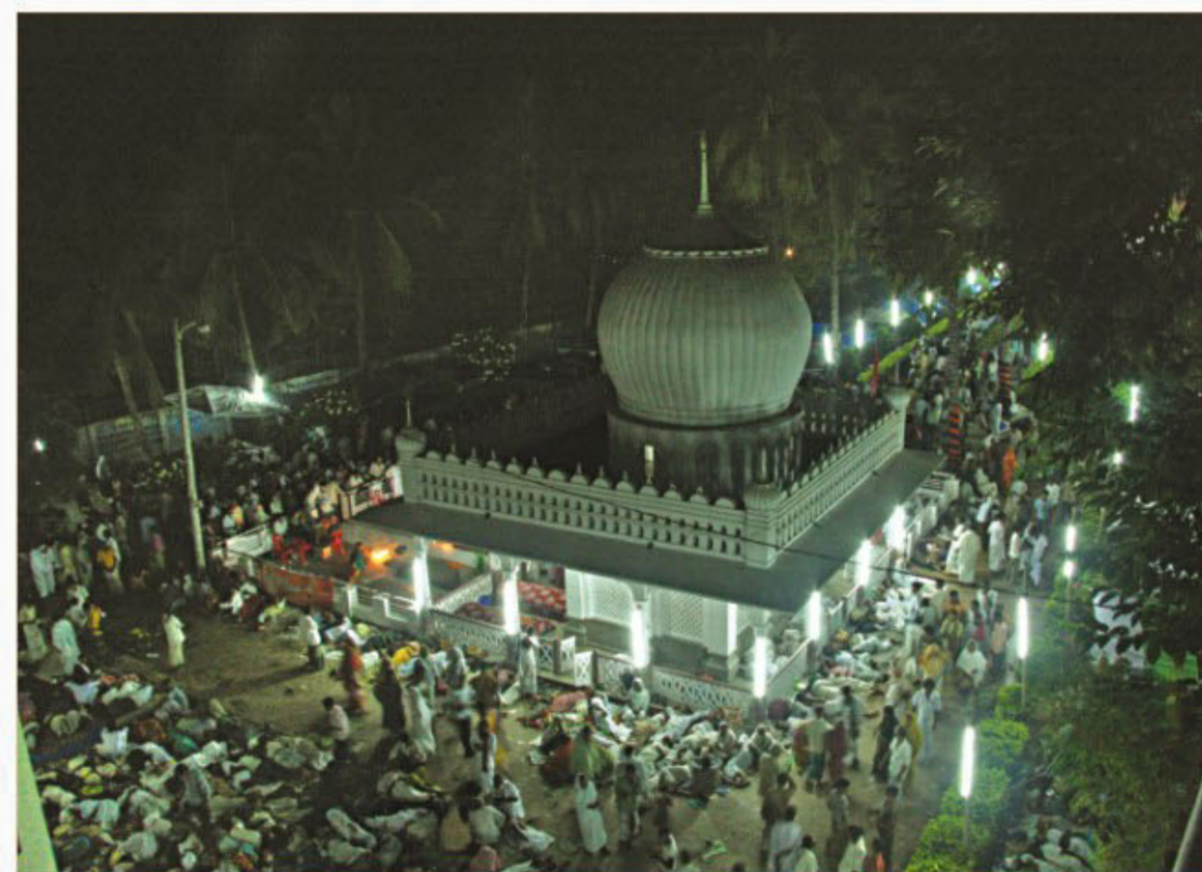
The video features the major attractions of Bangladesh through the eyes of a tourist, learning something unique from each step of her travels.