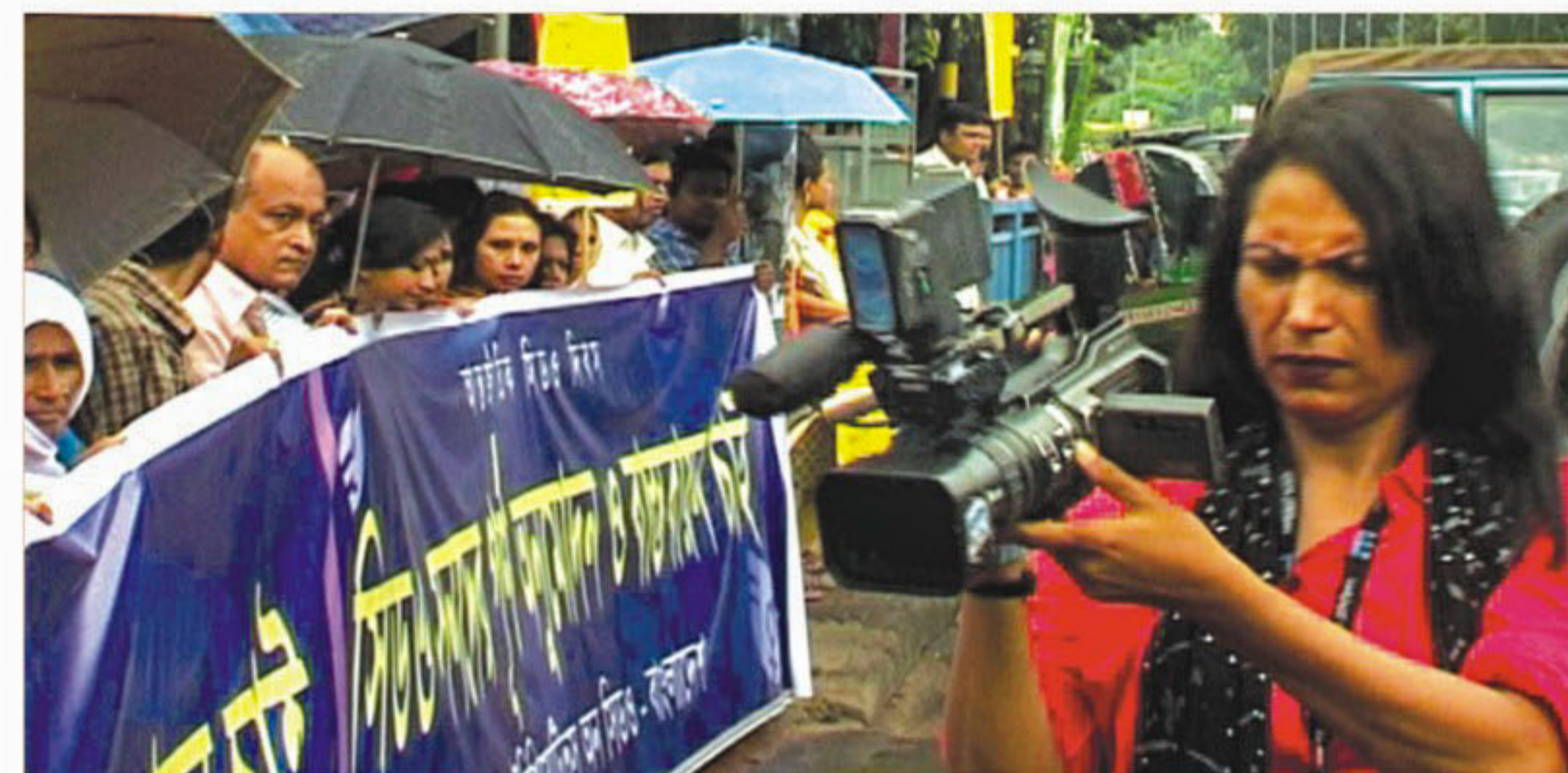
Scenes from "Journey through Journalism" (top) and "Lady with the Lamp".

AV Centre of Steps Towards Development has produced the documentaries.