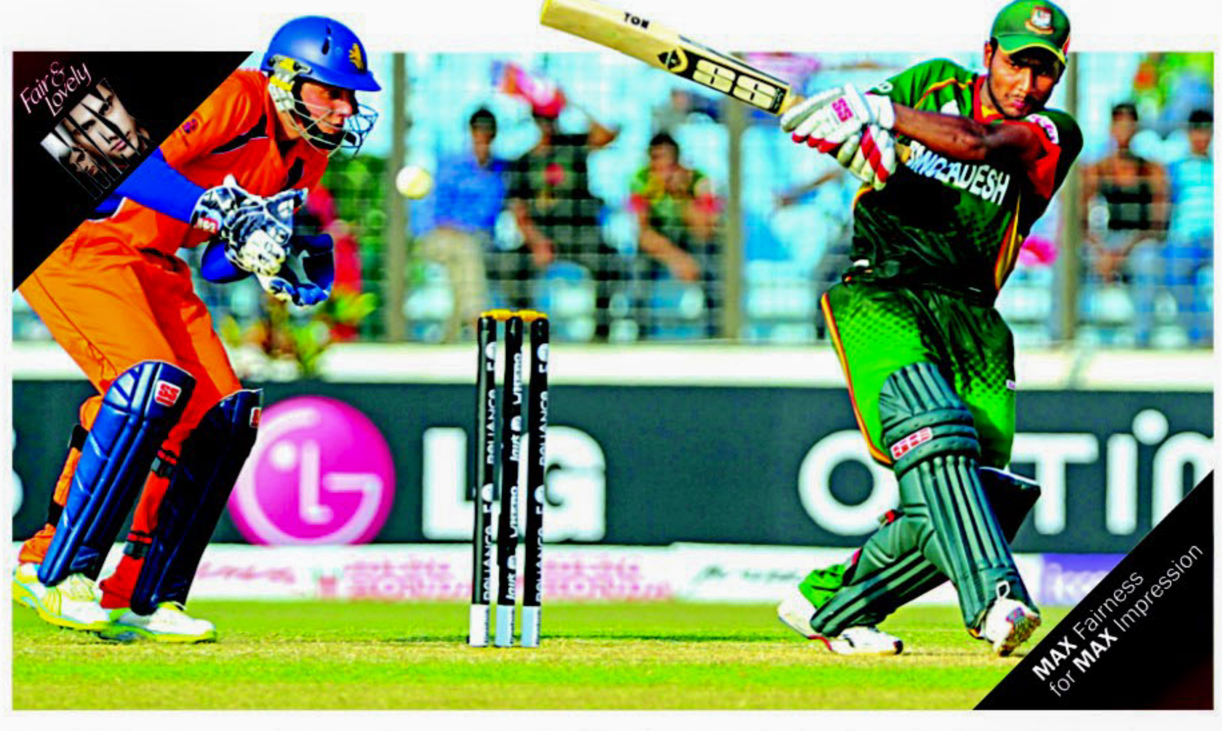
Bangladesh opener Imrul Kayes pulls the ball during his unbeaten 73 in the win against Netherlands at the Zohur Ahmed Chowdhury Stadium in Chittagong yesterday.